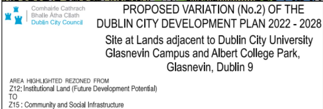
Figure 1: Location of Proposed Variation (No. 2) to the Dublin City Development Plan 2022-2028, lands adjacent to Dublin City University Glasnevin Campus and Albert College Park, Glasnevin, Dublin 9.