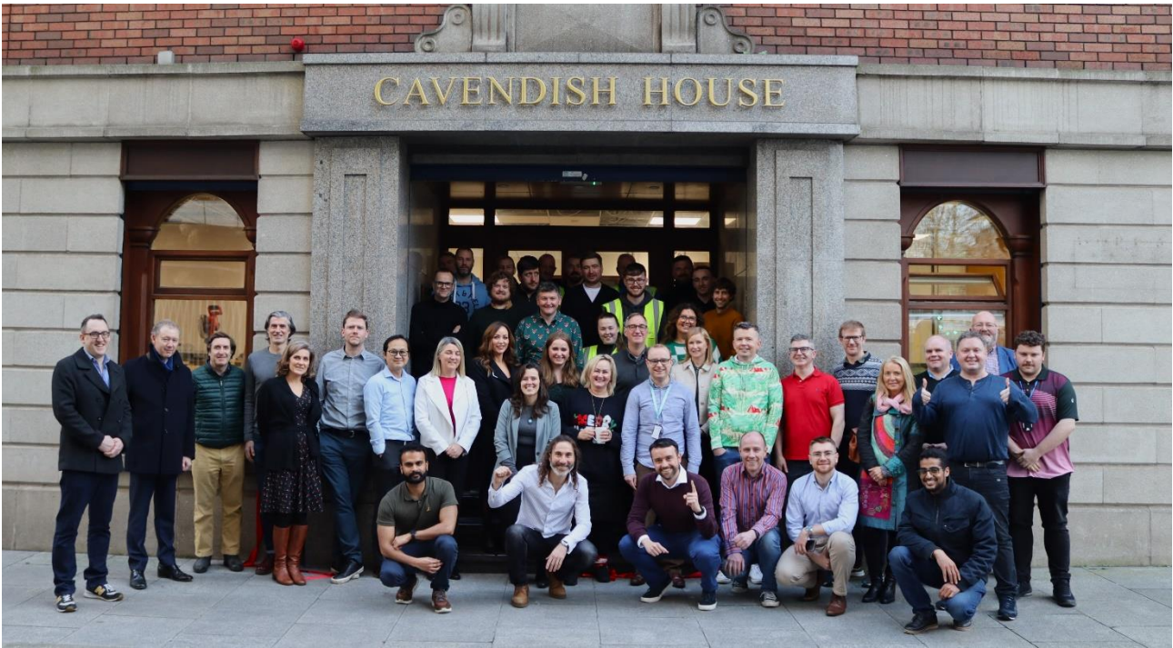
Image 10. Active Travel Office, December 2023