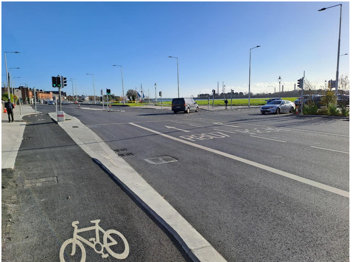
Image 4. C2CC - Redesigned Junction at Alfie Byrne Road has been fully opened for public use