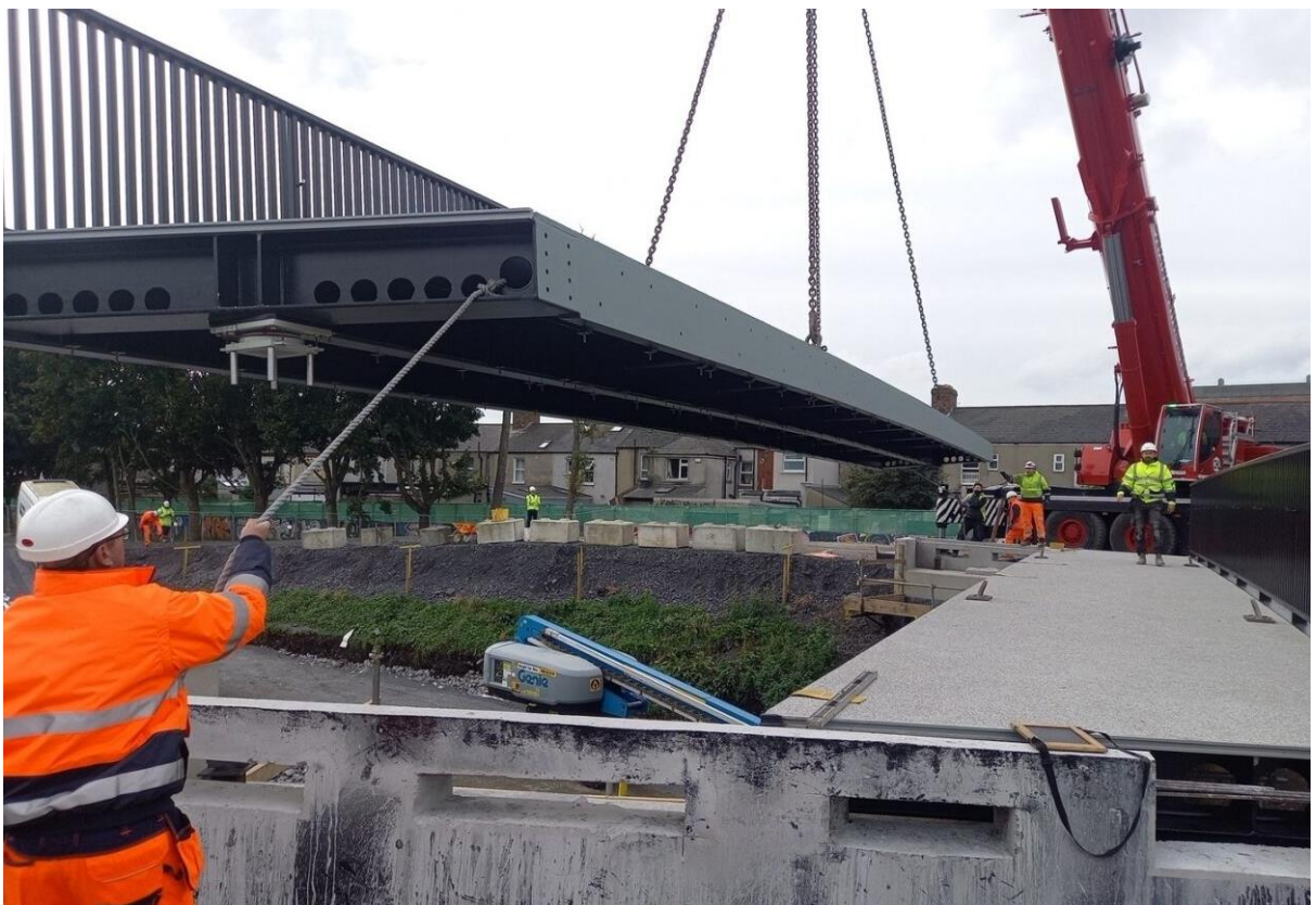
Image 6. Royal Canal Greenway Phase 3 – October 2023 Bridge Install