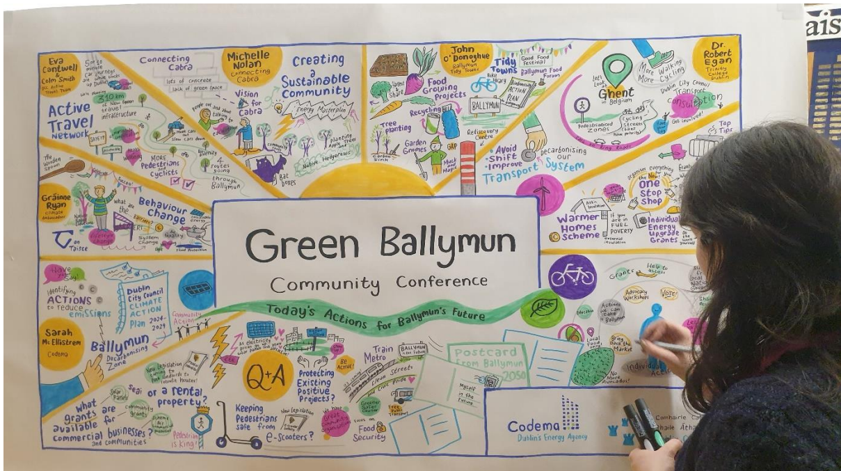
Image 1. Ballymun Decarb Zone public consultation, this event was attended by local councillors, members of the public and community groups.