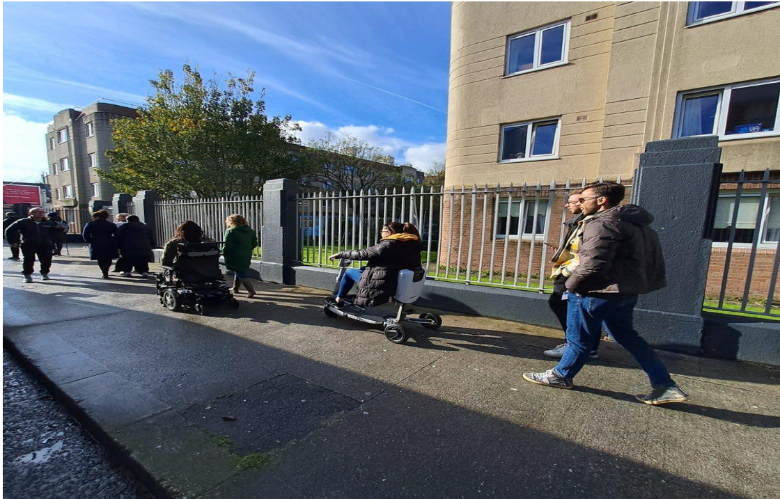
Image 2. Active Travel team facilitated a workshop for the FOLLOW project.