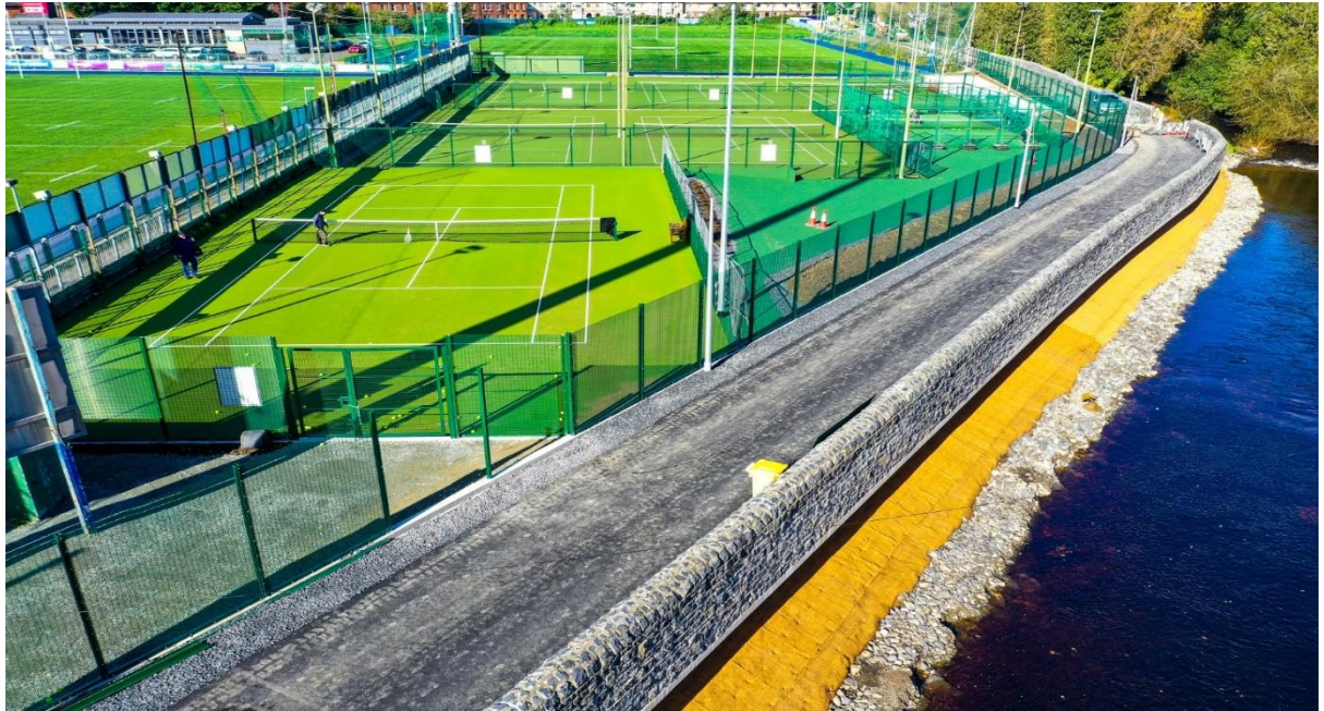
Image 8. Dodder Greenway & Flood Defence Herbert Park to Donnybrook – aerial view