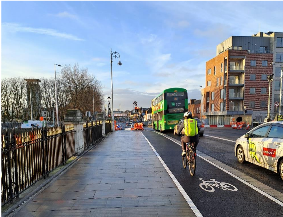
Image 3. C2CC - Works progressing well on Annesley Bridge inbound