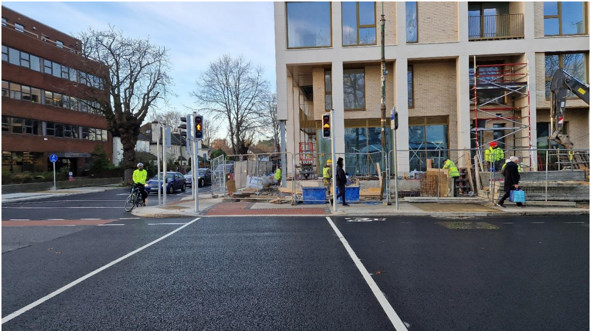
Image 7. As part of the Active Travel Network a new Toucan crossing was commissioned on Donnybrook Road.

Snagging works are well under way with commissioning expected early February 2024.