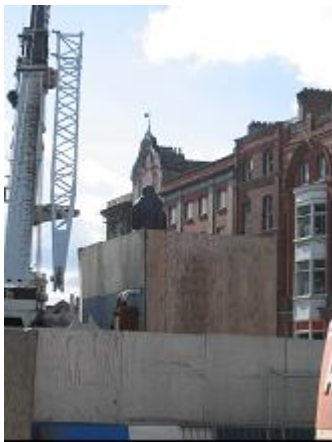
O'Brien statue under protective cover during construction of LUAS (tram) lines in October 2003

By 1929 traffic congestion on O'Connell Bridge was such that it was recommended by the Streets Section of Dublin Corporation that the O'Brien statue be removed from its location to a site near the centre of O'Connell Street approximately twenty feet south of the junction with Lower Abbey Street. 16