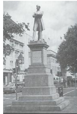
Archive photograph of O'Brien statue