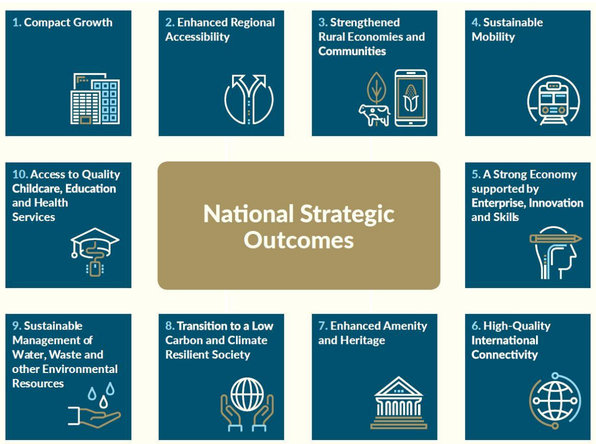
Figure 1-5: NPF National Strategic Outcomes

Compact growth is the first NSO and it has particular significance for spatial planning policy, requiring at least half of all future housing and employment growth in Dublin to be located within and close to the existing ‘built-up’ area of the city – specifically within the canals and the M50 ring which will require the progressive relocation of less-intensive land uses outside of this built-up area.