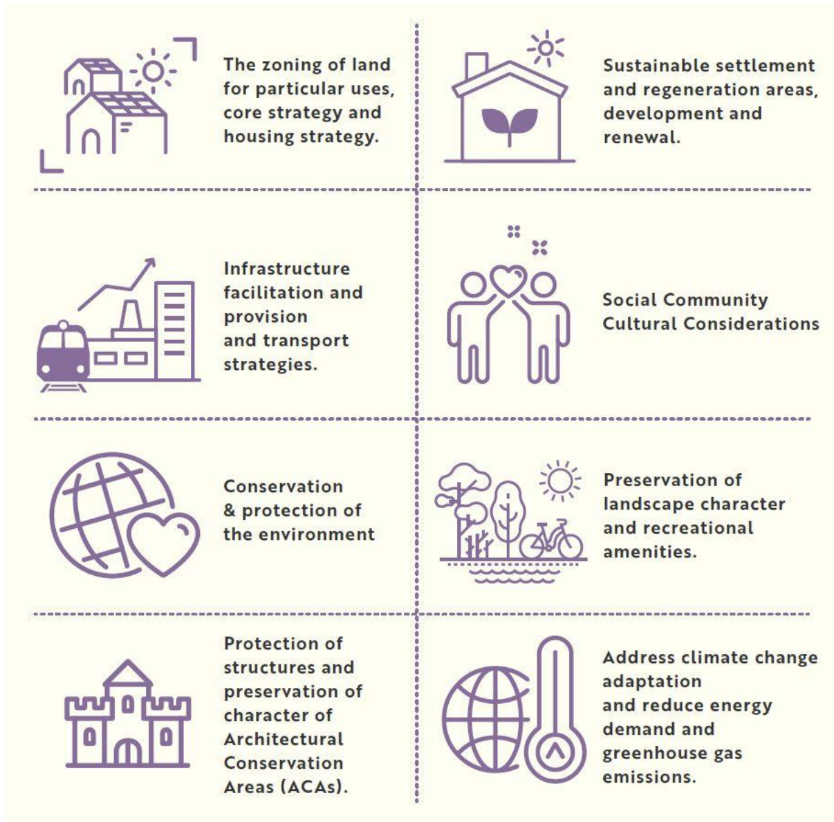
Figure 1-2: Mandatory Requirements to be Addressed by Development Plans

The Development Plan and in particular, the Core Strategy (see Chapter 2) sets out the spatial framework for the city within the context of the National Development Plan (NDP), National Planning Framework (NPF), the National Climate Action Plan (CAP) 2021, the Regional Spatial and Economic Strategy for the Eastern and Midland Regional Assembly (RSES) 2019, the NTA’s Greater Dublin Area Transport Strategy 2022-2042 and with the Specific Planning Policy Requirements (SPPRs) set out in the relevant Section 28 Ministerial Guidelines.