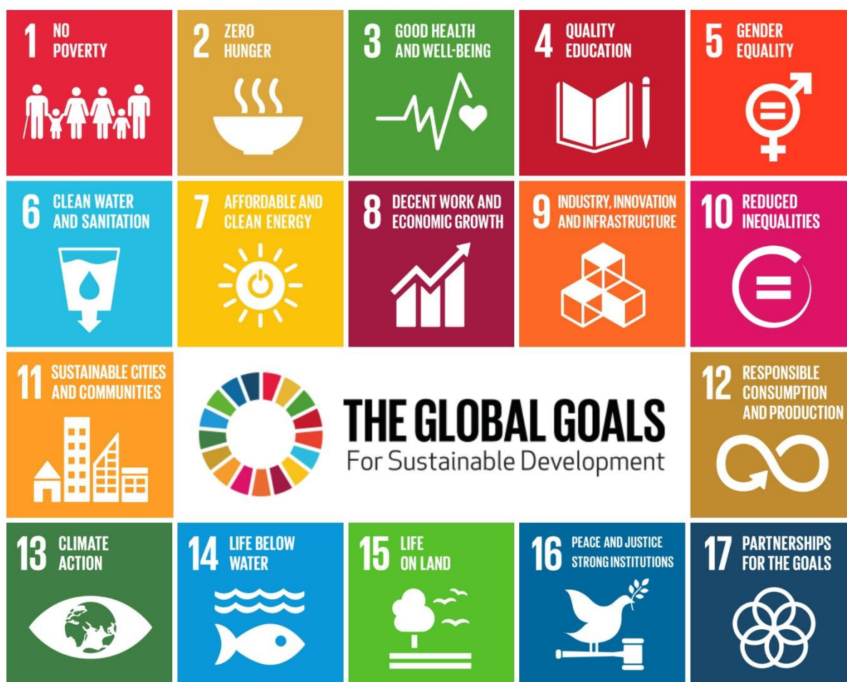
Figure 1-4: UN Sustainable Development Goals