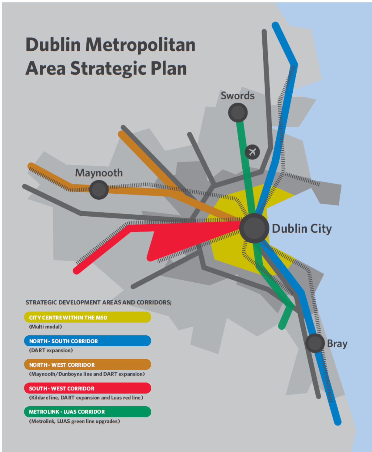
Figure 1-8: Dublin MASP

The MASP identifies a number of large scale strategic sites (strategic development lands), based on key corridors that will deliver significant development (housing and employment development) up to the year 2031.