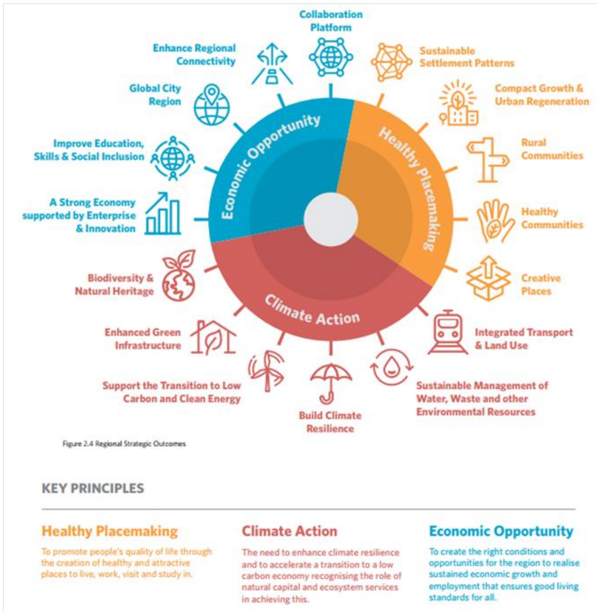
Figure 1-7: EMRA RSES Regional Strategic Outcomes

The RSES sets out the vision for growth (homes and jobs) and Regional Policy Objectives (RPOs) for the Region to the year 2031 and seeks a population increase of circa 100,000 people by 2031 in Dublin City.