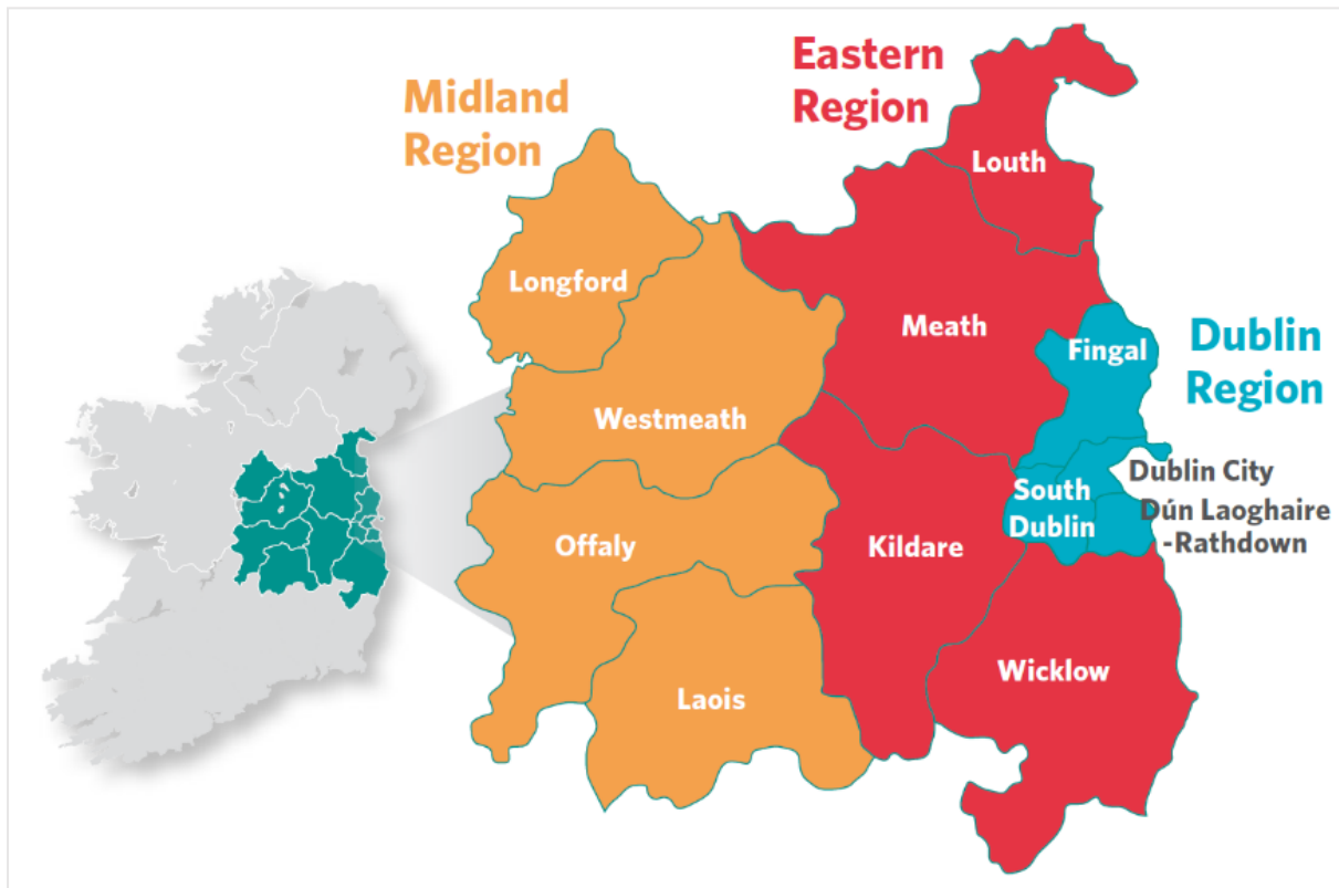
Figure 1-6: Dublin City in the EMRA Area

The RSES integrates the NPF objectives and the growth and Settlement Strategy at the regional level, ensuing coordination between the NPF and the Dublin City Development Plan.