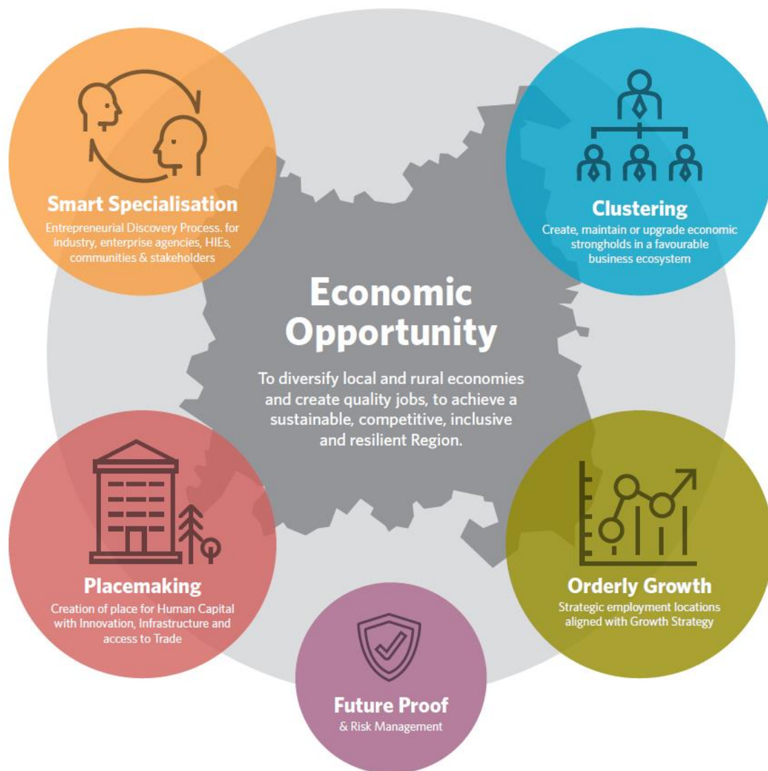
Figure 6-3: RSES Economic Strategy

The RSES emphasises the need to increase employment in strategic locations, to provide for people-intensive employment at sustainable locations near high quality public transport nodes, to build on commercial and research synergies in proximity to large employers, industry clusters and smart specialisation and to activate strategic sites to strengthen the local employment base in commuter towns.