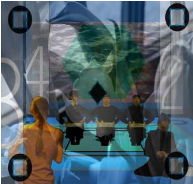
Installation sketch © 2009 ) + ( = a0 Photographs & digital manipulation © ( ajFM Embodiment: ) uMR , James Tyson, Adrian Ciglenean, Duncan Keegan, Inza Lim