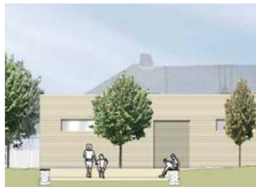
A Place to Meet