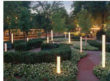
Planting & Natural Materials