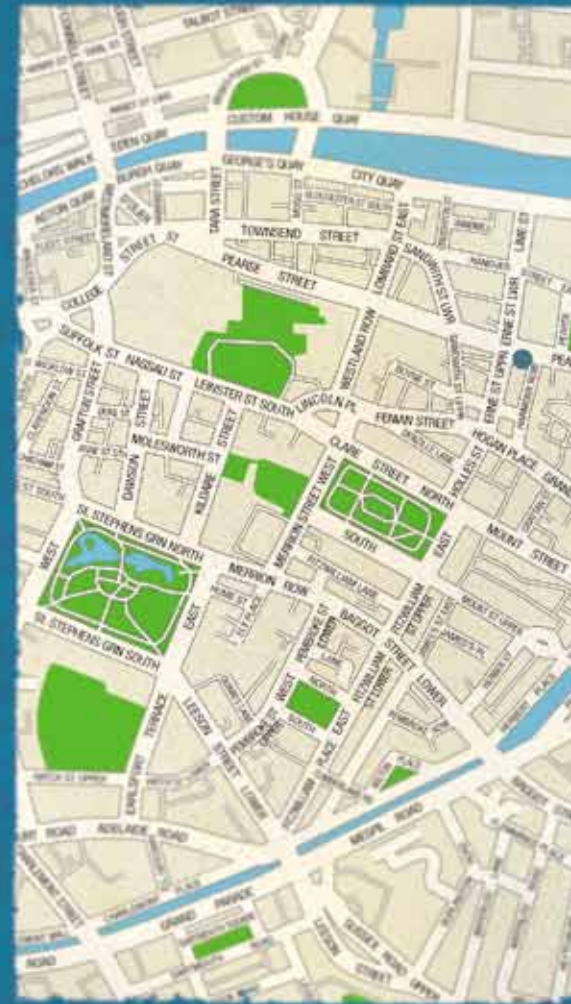
Map to Dublin City Library & Archive

Three of the above sessions, on 4 October 2010, 7 December 2010 and 1 February 2011 will consist of visits to archives to explore source materials at first-hand. There will also be four seminars in Dublin City Library & Archive on Saturday mornings on 27 November 2010; 5 February 2011; 19 February 2011 and 5 March 2011 from 10.00–13.00. In addition, there will be two full-day field trips, to be scheduled by consultation with the course participants.