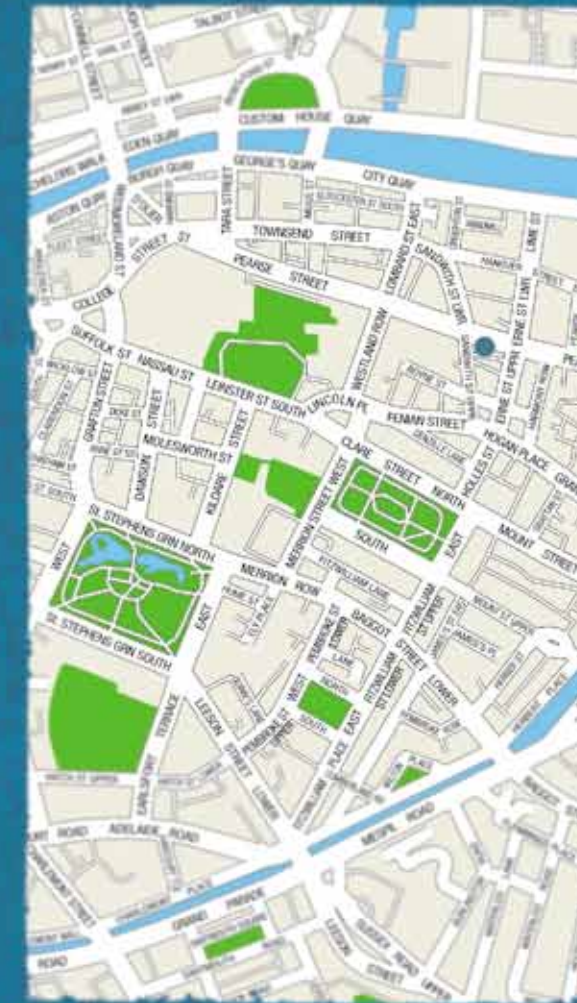
Map to Dublin City Library & Archive

Three of the above Tuesday evening sessions will consist of visits to archives to explore source materials at first-hand and there will be one visit to NUI Maynooth. There will also be four seminars in Dublin City Library & Archive on Saturday mornings in Spring 2012 on 11 February; 25 February; 10 March; 24 March. In addition, there will be two full-day field trips, dates to be scheduled by consultation between the Class Tutor and the course participants.