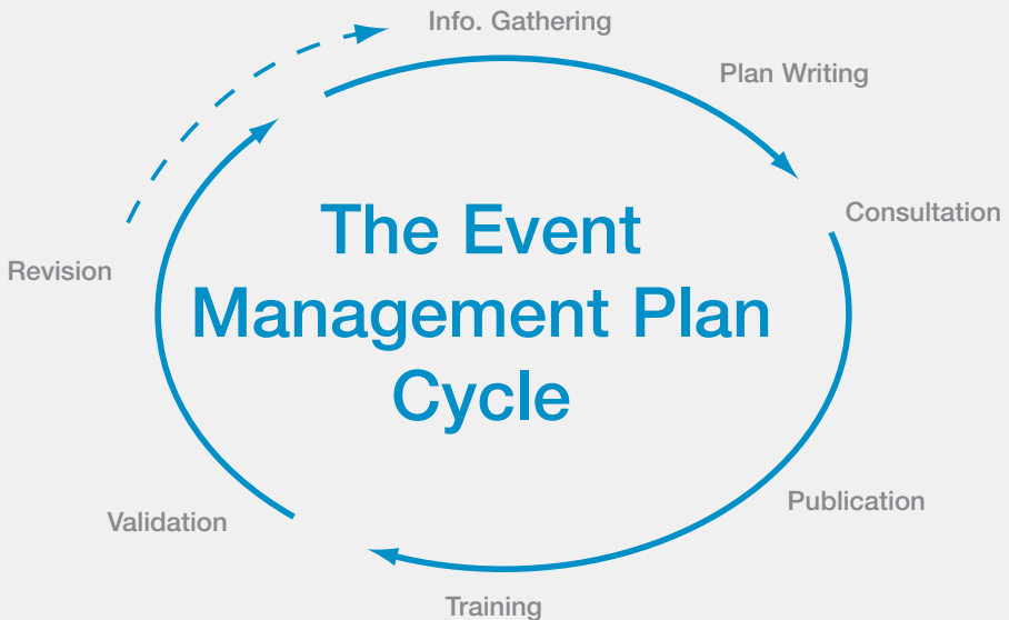
Figure 5: Event Management Planning cycle Figiúirí 5: Cúrsa Pleanála ar Bhainistíocht Imeachta

informed of the plan content and the plan structure should be clear, concise and easy to read. All recommendations and advice given by the statutory agencies, emergency services etc. should be incorporated in the event plan. The following schematic illustrates the cycle for the production of a comprehensive event management plan.