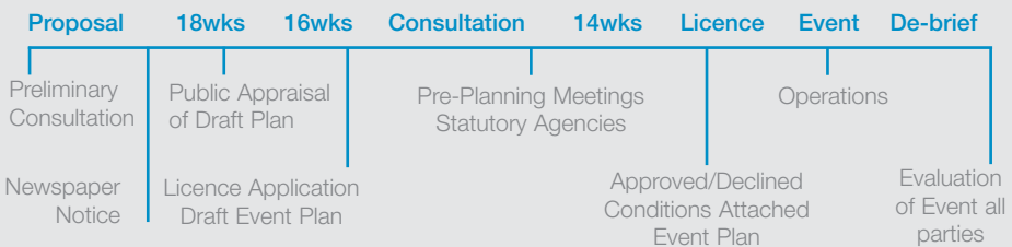
Figure 3: Licence application timeline Figiúirí 3: Amchlár Iarrtais Ceadúnais

to submit a draft plan of the event to the Local Authority Planning Dept., the Gardai and the Health Authority at least 16 weeks in advance of the event. Prior to the submission of the plan an advertisement must be placed in the national and local newspapers notifying the public of the organisers intention to hold an event at a particular time and place. The draft plan will be circulated by the local authority to all relevant departments within the local authority and will be made available at the local authority offices for viewing by any member of the public; this enables any interested party to make observations on the proposed event to the local authority who are the licensing authority for such events. The following is a schematic example of the timeline in relation to an event requiring an outdoor event licence. This timeline is indicative of the standard that should be applied to all events.