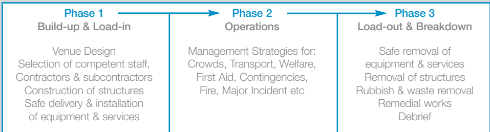
Figure 1: Event Phases Figiúirí 1: Céimeanna an Imeachta

Any event will involve elements of each phase and you should identify those issues, which are relevant to your event and plan accordingly.