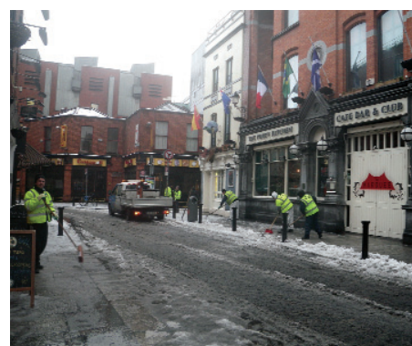
Staff from Drainage Services clearing snow from the footways in Temple bar