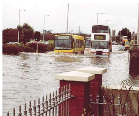
Flooding on Clontarf Road - February 2002