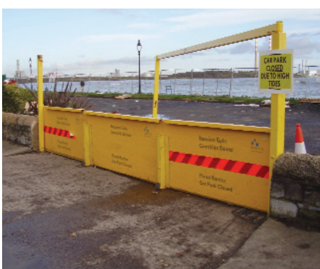
Protection from tidal flooding in Sandymount