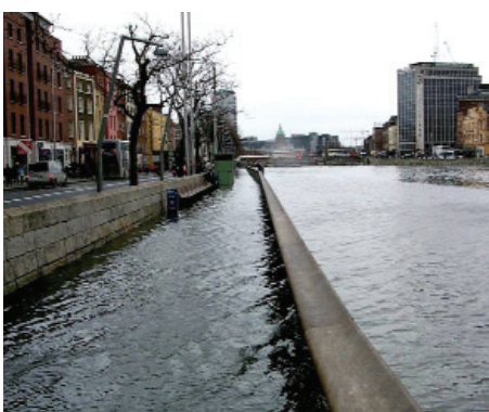
Flooding - Liffey Boardwalk - February 2002