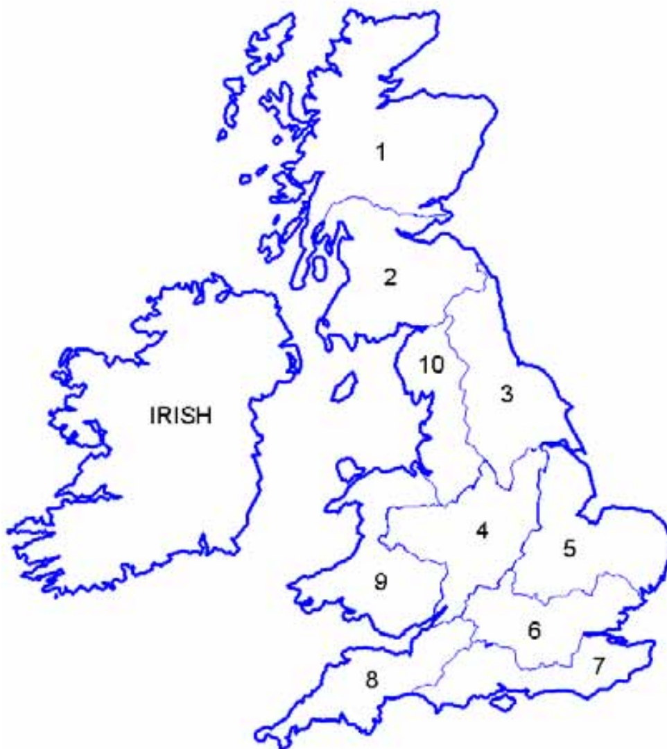
Figure C1 UK Hydrological Growth Curve Regions