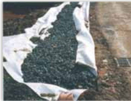
A Filter Drain under Construction

Preliminary monitoring results suggest that filter drains have a finite lifespan. Many are prone to clogging due to the absence of some form of pre-treatment device. Rumble strips or other measures can be incorporated to minimise stone scattering by vehicles. They have performed well on major roads, but may receive higher solids in urban use areas.