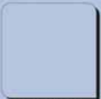
Volume Five Climate Change