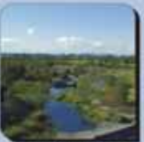
Volume Three Environmental Mngt