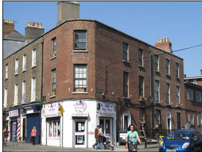
View of corner sited grouping