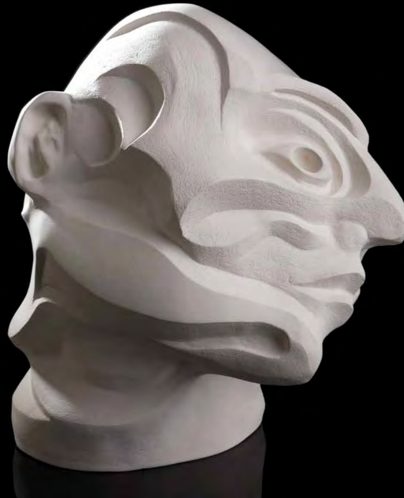
Portrait of a Man

Vision Guiding Principles Foreword Introduction Timeline