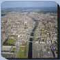
Volume One Overall Policy Document