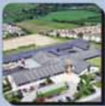
Volume Two New Development