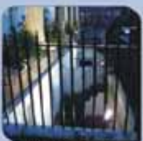
Volume Six Basements