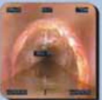
Volume Four Inflow, Infiltration & Ediltration