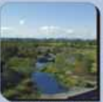
Volume Three Environmental Mngt