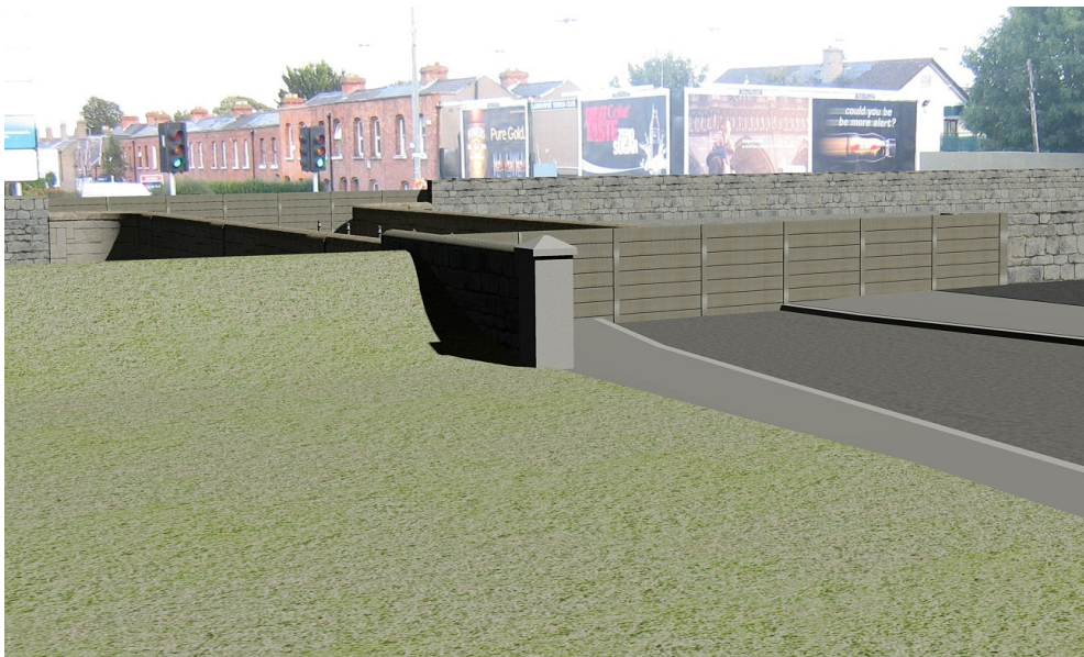
Bridge with demountable barriers in place (flood conditions)