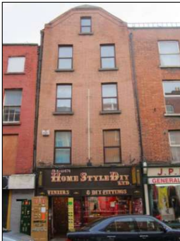
PHOTO OF STRUCTURE

Recommendation: Addition of '1 Mary Street, Dublin 1' to the Record of Protected Structures in accordance with Section 54 and 55 of the Planning and Development Act, 2000.