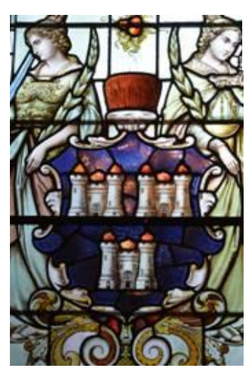
Section of Stain Glass Window

The staircase is noteworthy for the balusters which are three to a step and are admired for their fine spiral turning, known as 'barley sugar'.