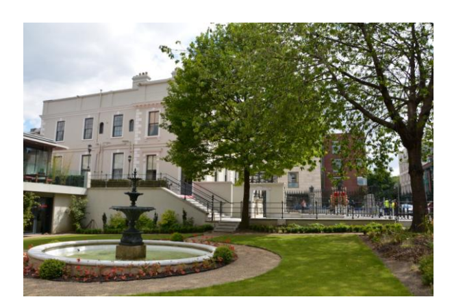
Lord Mayor's Garden

Boasting many fine features and rooms that have rightly allowed it to be compared with other renowned Dublin attractions, such as Trinity College, the National Art gallery and City Hall, the Mansion House started its life faced in brick but was later plastered and had the city coat-of-arms added to its pediment. The Round Room beside the house was built in 1821 for a visit by King George IV. The house would originally have been set in its own wooded grounds but now only a small garden remains.