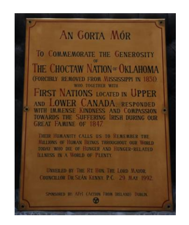
Choctaw Nation of Oklahoma Plaque