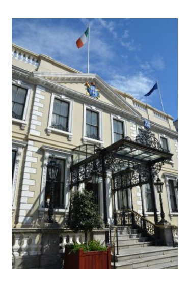
Mansion House Today