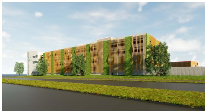
4 NORTH FACING PERSPECTIVE 1 : 4