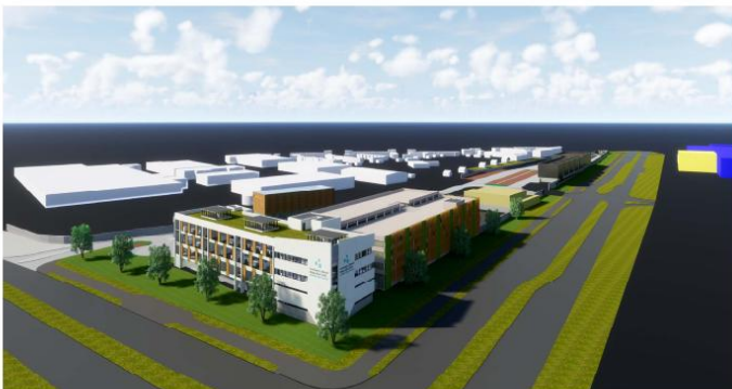
1 NORTH EAST AERIAL CORNER PERSPECTIVE 1 : 4