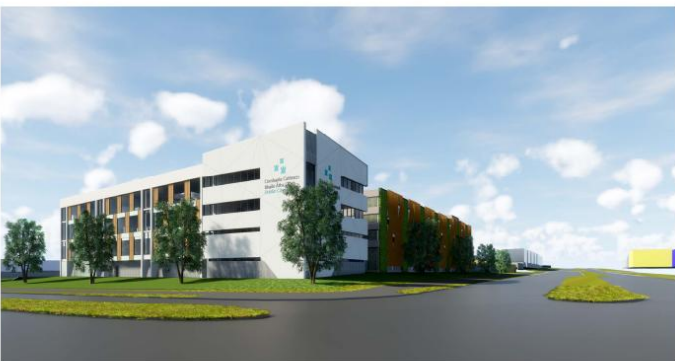
3 NORTH EAST CORNER PERSPECTIVE 1 : 4