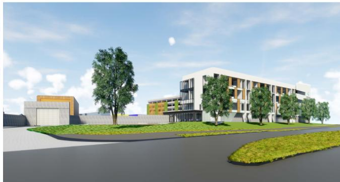
2 SOUTH EAST CORNER PERSPECTIVE 1 : 4