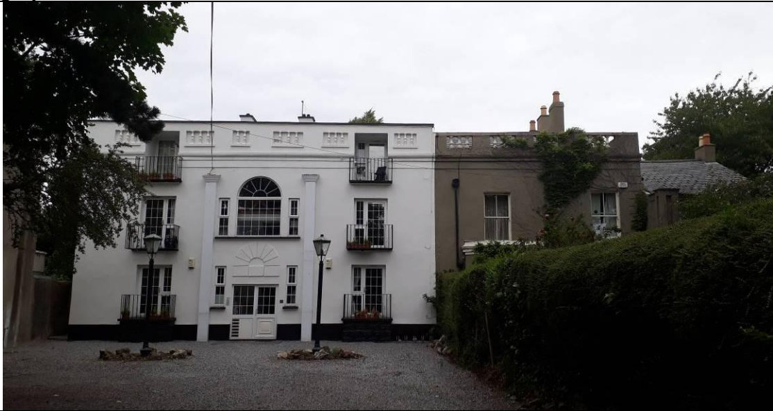
Three-storey semi-detached apartment block with original two house to east