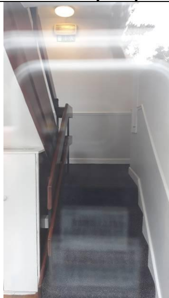
Main staircase at ground floor level