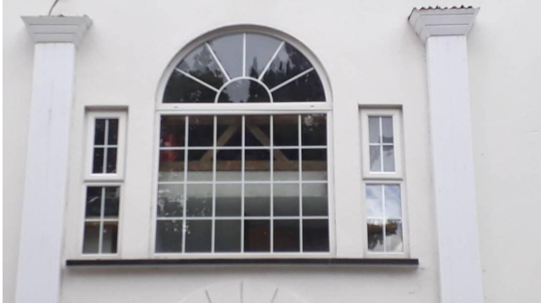
Front floor uPVC 'Wyatt style' window