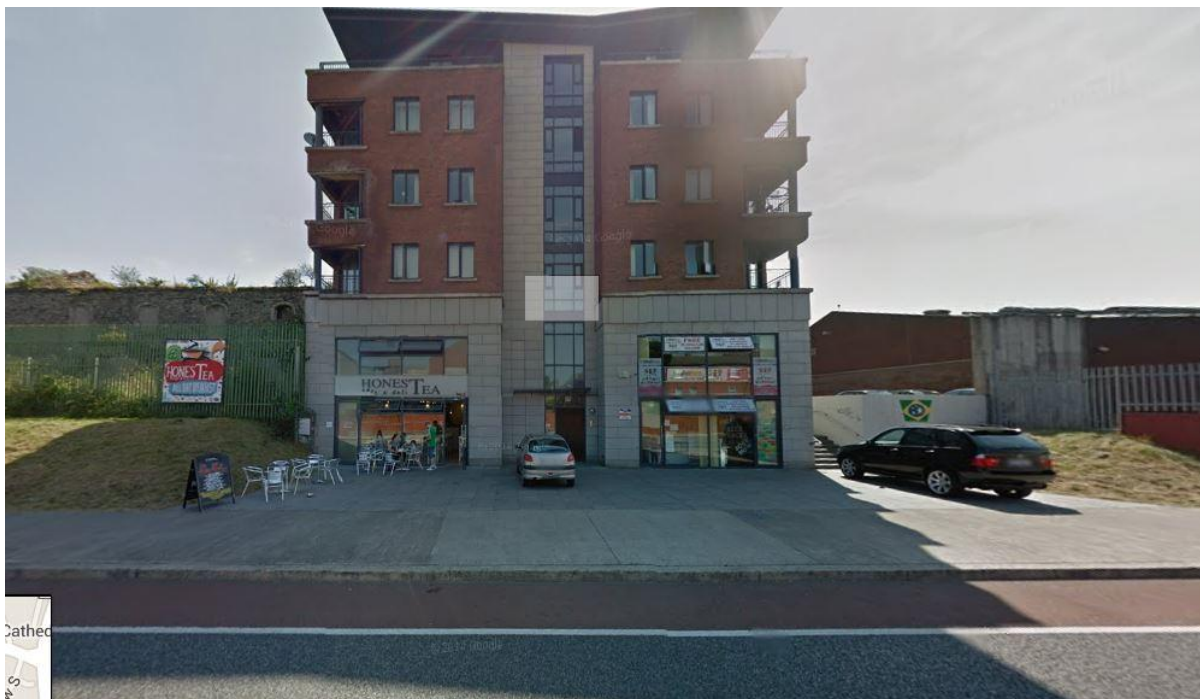
Fig 1: Subject land prior to improvement works at St Luke's Church and removal of redundant drainage chamber.