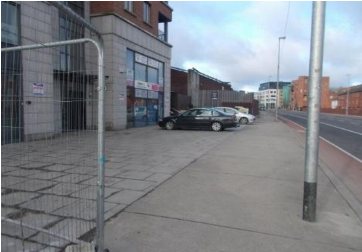
Fig 4: View of the forecourt area (denoted by the flag paving) with parking