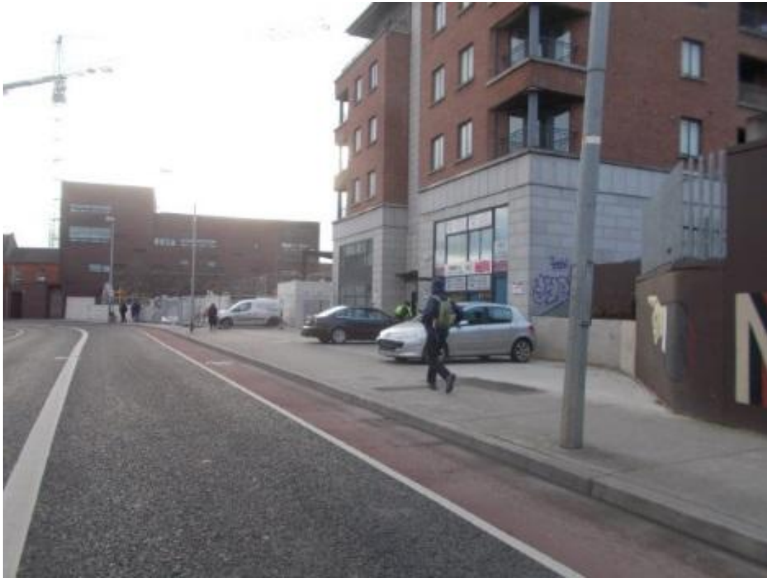
Fig 3: Parking on the forecourt area during works to develop St Luke's Garden.