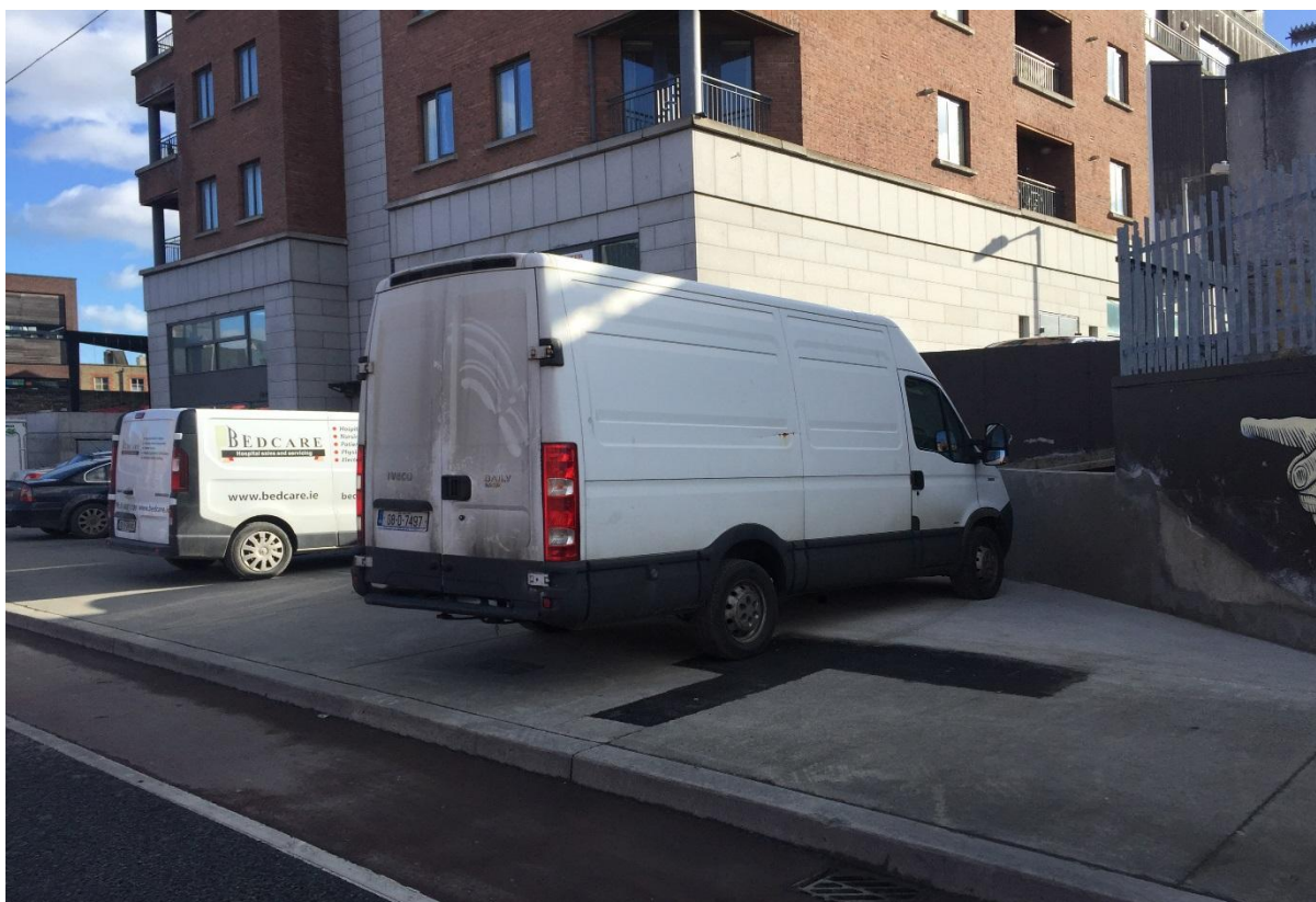
Fig 2. Parking overspill from the forecourt area. Note the large van also encroaches on the public footpath.