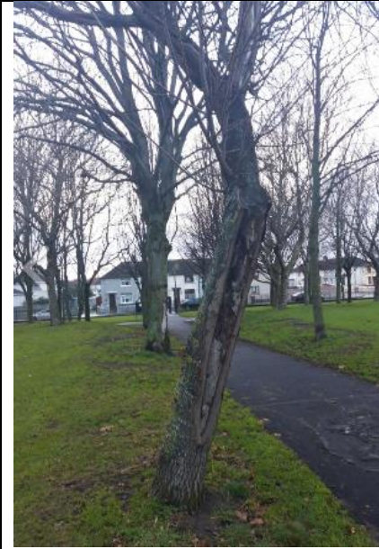
Lime tree. Tree Number 01K8