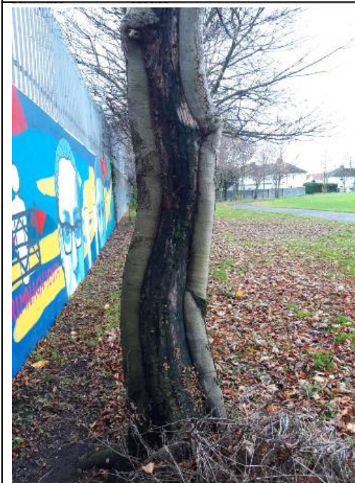
Beech tree: tree 01J0