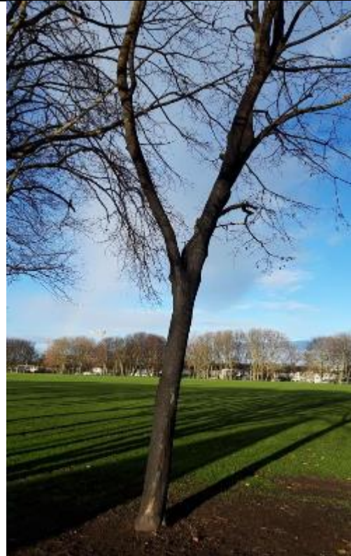
Lime tree, entirely scorched. Tree Number 01KA