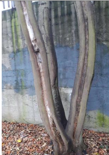
Beech tree. Tree Number 01J5