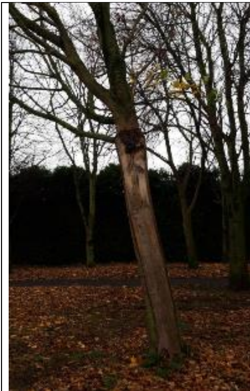
Norway maple has broken in 2 when compression fork failed during high wind Tree Number 01HS

The assessment found 4 trees which suffered catastrophic damages during wind events. All 4 are Norway maples ( Acer platanoides ) which lost major limbs as a compression fork failed.