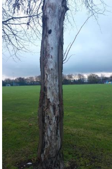
Lime tree. Tree number 01K5