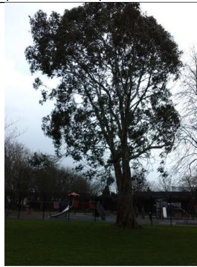
Tree with compression fork, codominant stems, basal wound, and fungi beside playground.