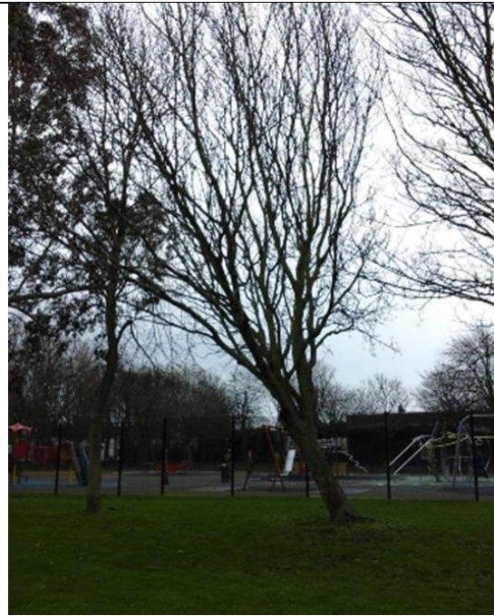
Sorbus aria with severe lean beside playground Tree Number: 01AL