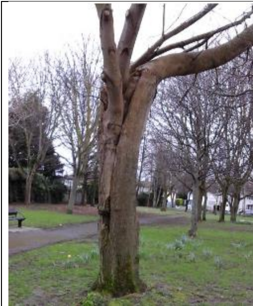
Norway maple compression fork failure. Tree Number 01Ak