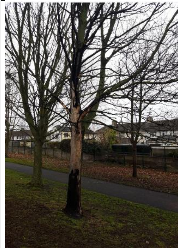
Norway Maple Extensive damages due to fire. Tree Number 01KS

The inventory noted that 11 trees have been severely burnt by fires lit at their bases. The damage done is so extensive that the trees have to be removed.