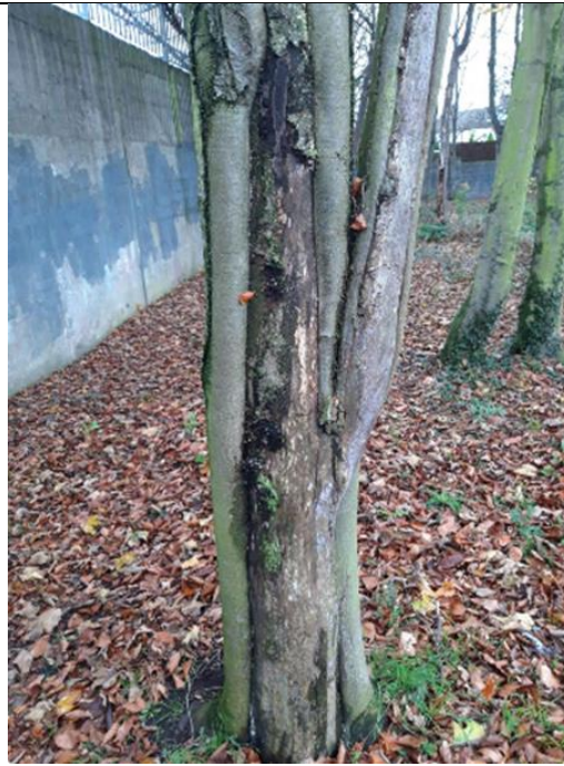
Beech tree: tree 01J3