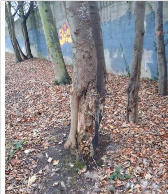
Beech tree. Cavity with extensive decay. Tree number 01J7