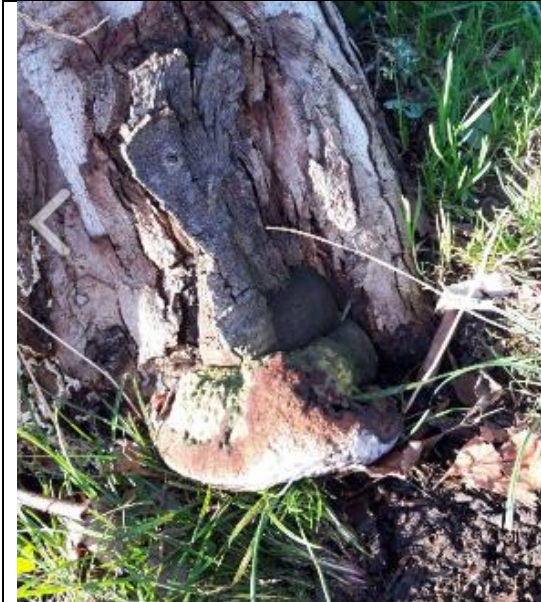
Ganoderma australe (first bracket)

Ganoderma australe is a perennial woody fungus bracket. It can extend from damaged wood to previously sound sapwood. When advanced and extensive, the decay can result in failure of the stem, base and rootplate. The presence of 2 brackets shows that the fungi have started to successfully colonise the base of the tree. As the tree is located beside a playground, as the Eucalyptus is a brittle species in Ireland, and due to the fact that the tree has basal wound and codominant stems, the removal is inevitable.