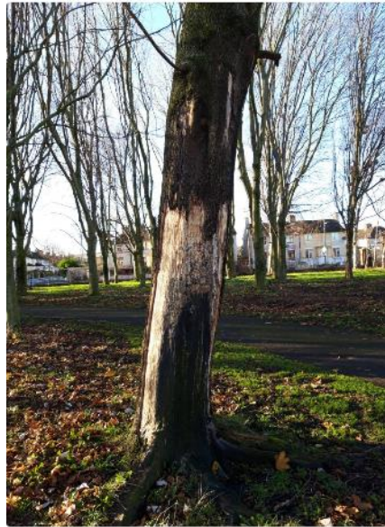
Norway maple tree: Tree number 01KL