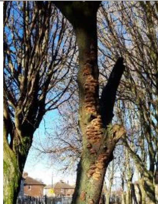
Prunus cerasifera nigra : Tree 01KH