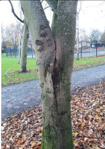
Norway maple with compression fork starting to split. Tree Number 01HP