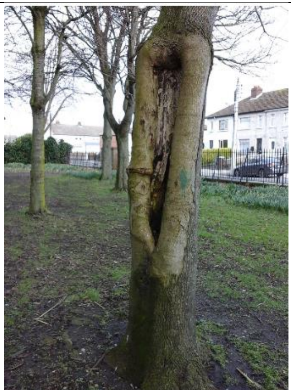
Norway maple with large cavity and decay due to compression fork failure during high wind Tree Number 01HS