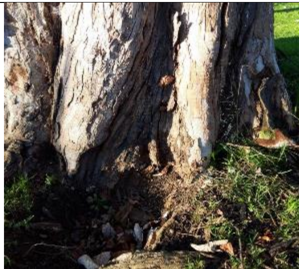
Basal wound and Ganoderma brackets