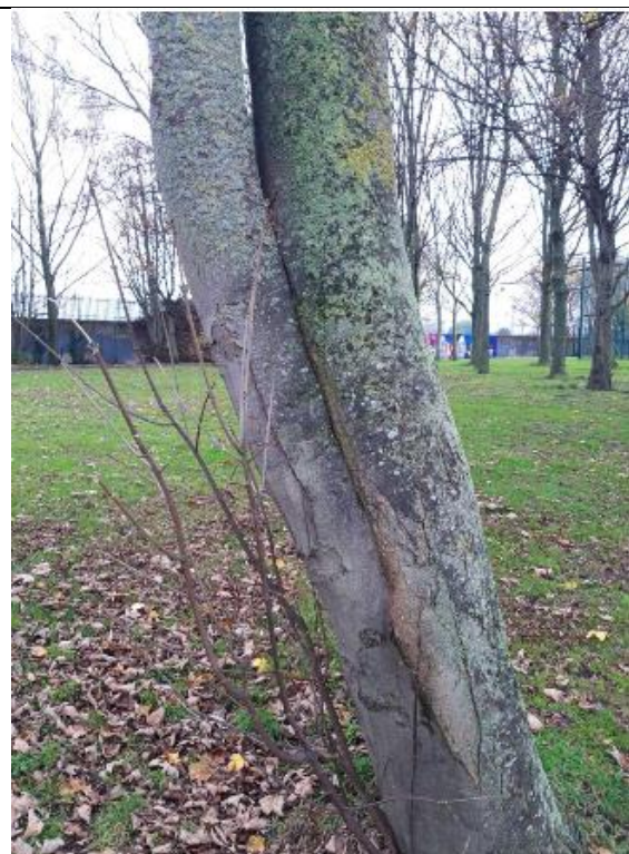
Norway maple. tree number 01HV