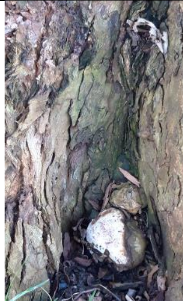
Immature form of Ganoderma australe (second bracket)