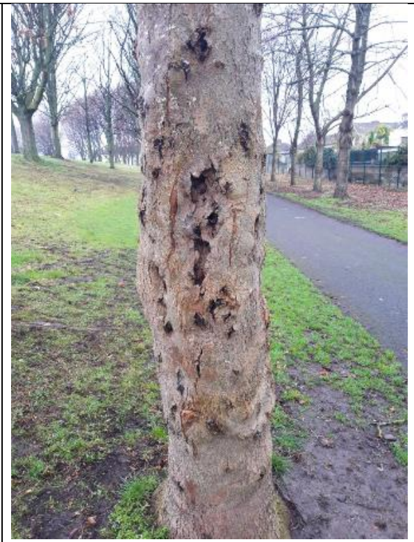
Ash Tree. Number 01KR