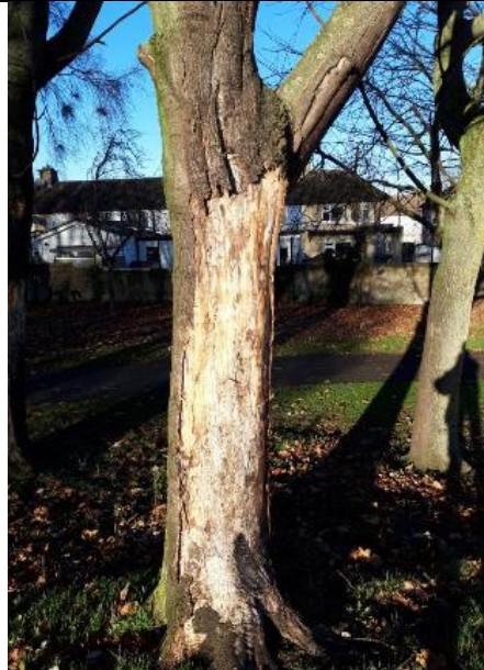
Norway Maple. Tree Number: 01kM