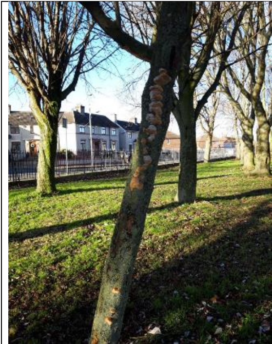
Prunus cerasifera nigra . Tree 01KJ