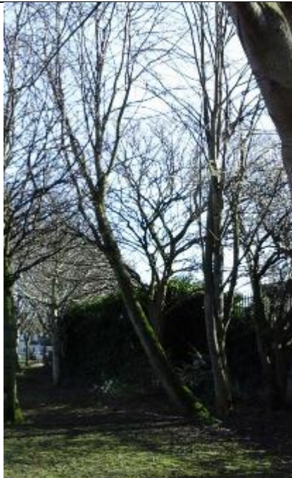
Beech tree with extensive lean close to footpath. Tree Number: 01B5.

While trees can “correct themselves” by developing a balancing canopy, 2 Trees will have to be removed as the lean is too advanced and due to their locations close to paths and playgrounds.