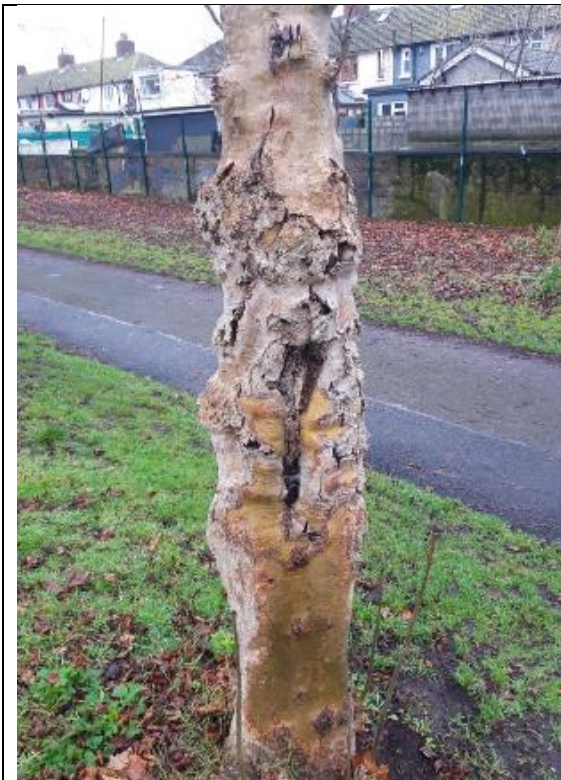
Ash Tree. Number: 01KP

3 Fraxinus excelsior (Ash Trees) will be removed due to a disease called Bacterial Canker of Ash. It is caused by the bacteria Pseudomonas syringae ssp. savastanoi pv. Fraxini and it is not related to Ash Dieback disease. Previous wounds are invaded by the pathogen which develops into lesions that may exude a sticky fluid. Over time the bark dies and peels back. In some cases, trees with Bacterial Canker live for many years and be hardly affected; others develop large lesions and fail especially if the lesions ring the trunk or branch.