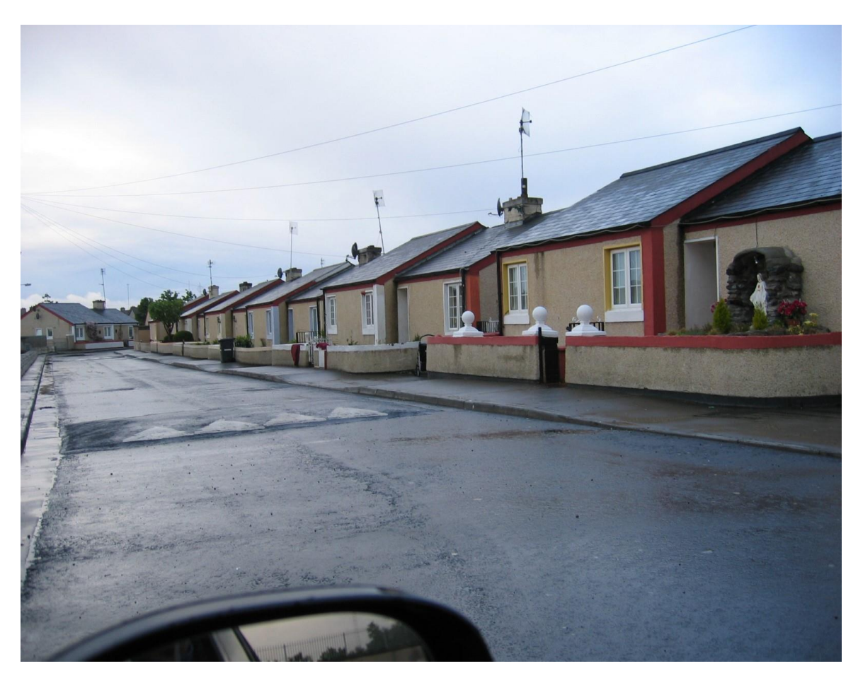
Cara Group Housing Scheme, Belcamp Lane, Coolock, Dublin 17

A review workshop of the City Council's LTACC's Terms of Reference was facilitated by the Irish Traveller Movement in 2019. This is the third such review of the workings of the LTACC following on from two previous reviews. The purpose of these reviews was to consider how the LTACC could work better and all members were able to commit to an improved and agreed set of principles in order to ensure the Committee can work more effectively. The Draft Terms of Reference agreed at the most recent workshop are detailed in Appendix 1.