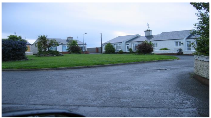
St Mary's Park Group Housing Scheme, Dunsink Lane, Dublin 10

All projects are subject to agreement with the LTACC, Traveller Representative Groups and most importantly the members of the Traveller Community within the Local Authority Area<sup>40</sup>.