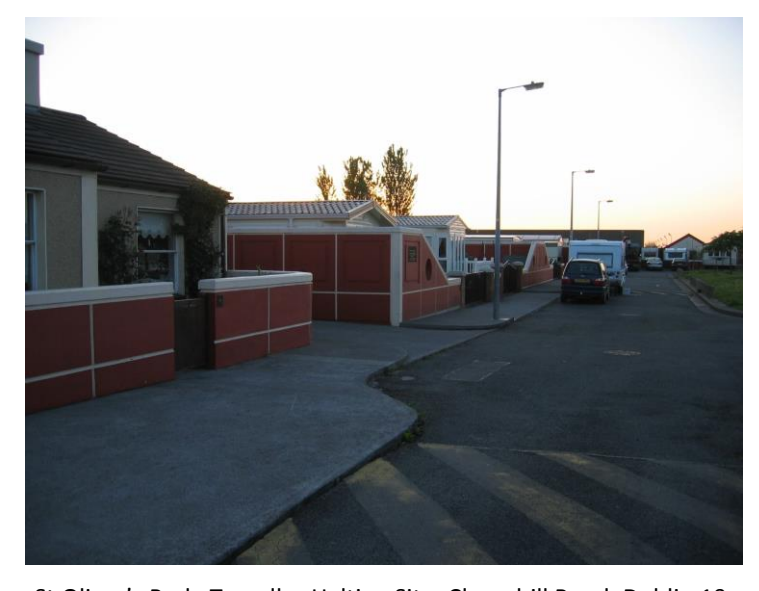
St Oliver's Park, Traveller Halting Site, Cloverhill Road, Dublin 10.