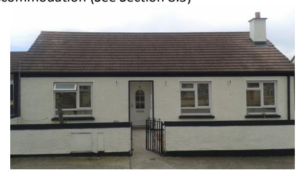
Typical House, Cara Close, Belcamp Lane, Coolock, Dublin 17