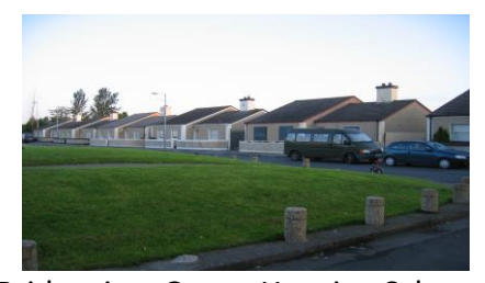
Bridgeview Group Housing Scheme

Fire safety on all sites (authorised and unauthorised) is of paramount importance. The redevelopment of Traveller Halting sites and new builds will go some way towards addressing those needs. Dublin City Council currently provides and maintains, on an annual basis, fire safety equipment on all sites including home fire/smoke alarms, carbon monoxide alarms, fire blankets and fire extinguishers in all Group Housing sites, Halting sites, sanitation units and unauthorised sites across the city. Further enhancements on Halting sites, places where grouped sanitation units are provided and unauthorised sites include the provision of larger extinguishers on external poles to assist in the prevention of fire spreading. Dublin City Council are currently seeking options with regards to external alarms on Halting sites and unauthorised sites with a view to enhancing fire safety by providing an alarm that alerts all families on site to a potential danger. Further consultation will take place where overcrowding occurs to move mobile home in order to be compliant, to allocate under the Scheme of Lettings where appropriate or to build overcrowding extensions onto existing houses<sup>49</sup>.