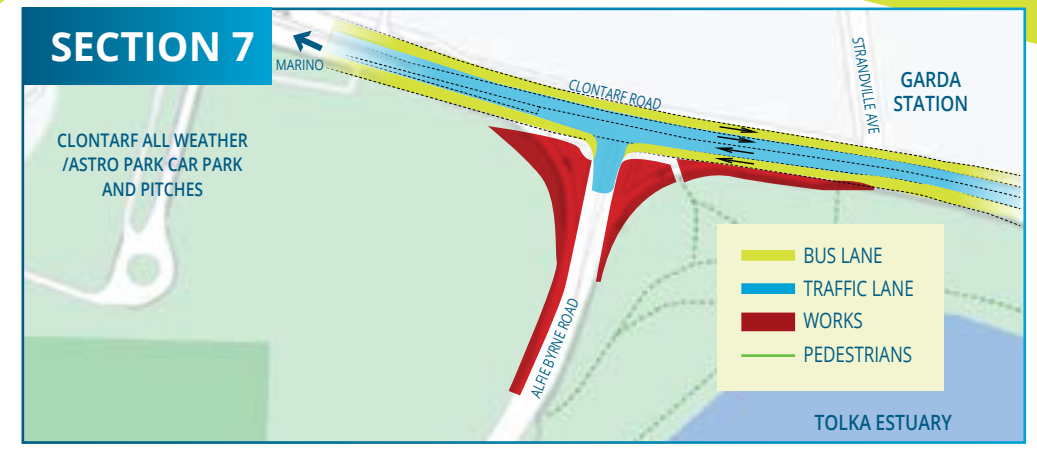
Junction of Clontarf Road and Alfie Byrne Road - March to May 2022