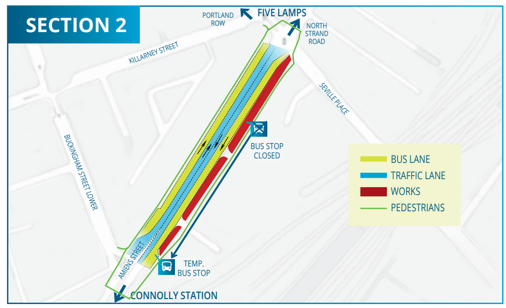
Section 2 Amiens Street - Buckingham Street to the Five Lamps Junction at Portland Row - March to June 2022

The first phase of construction works will take place along the inbound side of Sections 2 and 6. For these sections, four lanes of traffic will be maintained, two inbound and two outbound, with a dedicated bus and traffic lane maintained in each direction. Some bus stops will be temporarily moved or closed. See images below and overleaf.