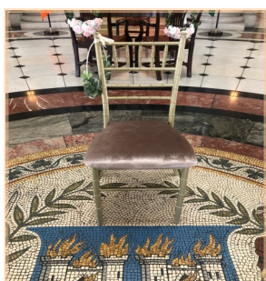
City Hall Gold Chiavari Chair

City Hall provide an oak antique table and chairs for you both and your solemniser. We also provide 100 gold Chiavari chairs for your guests. You have the option of hiring chairs but if you do, we request you arrange collection of the chairs within an hour of your ceremony ending. We will supply you with a list of chair hire companies upon request.