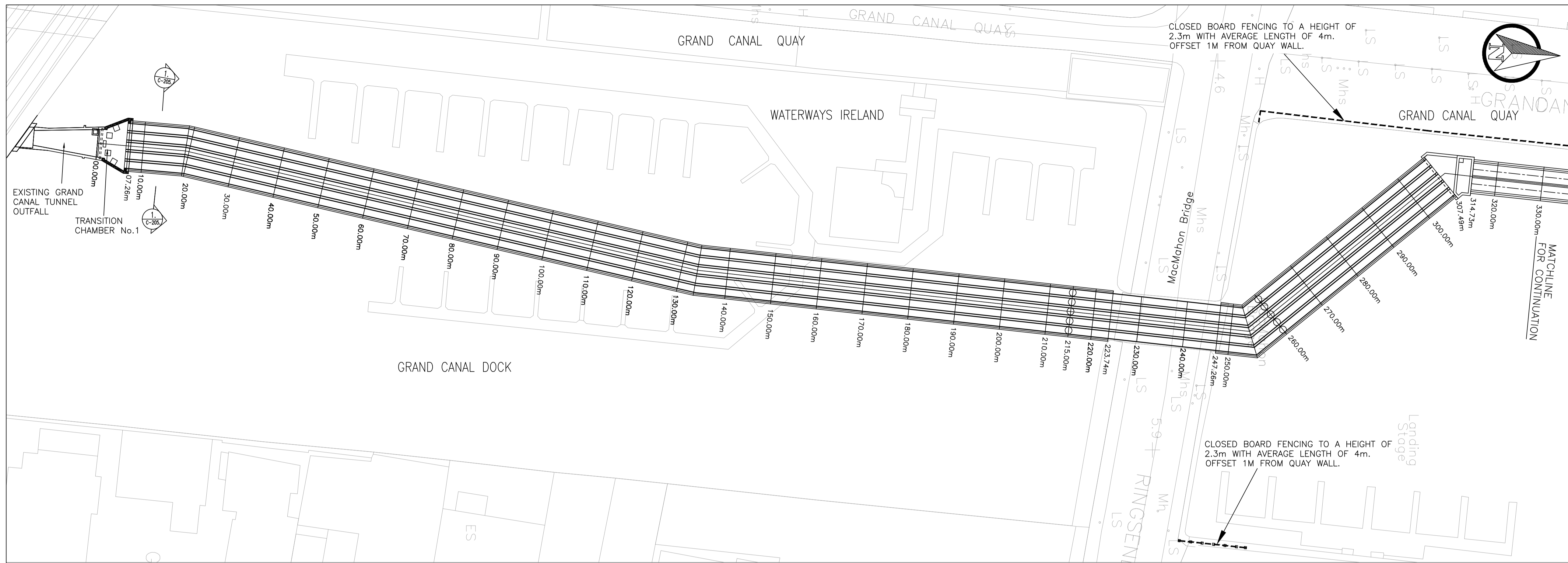
PLAN OF PIPELINE (CHAINAGE 00.00m TO 340.00m)