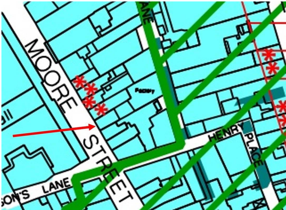
Figure 1: Site Location and Land Use Zoning

The subject structure is located in an area zoned Z5, the objective of which is “To consolidate and facilitate the development of the central area, and to identify, reinforce, strengthen and protect its civic design character and dignity”.