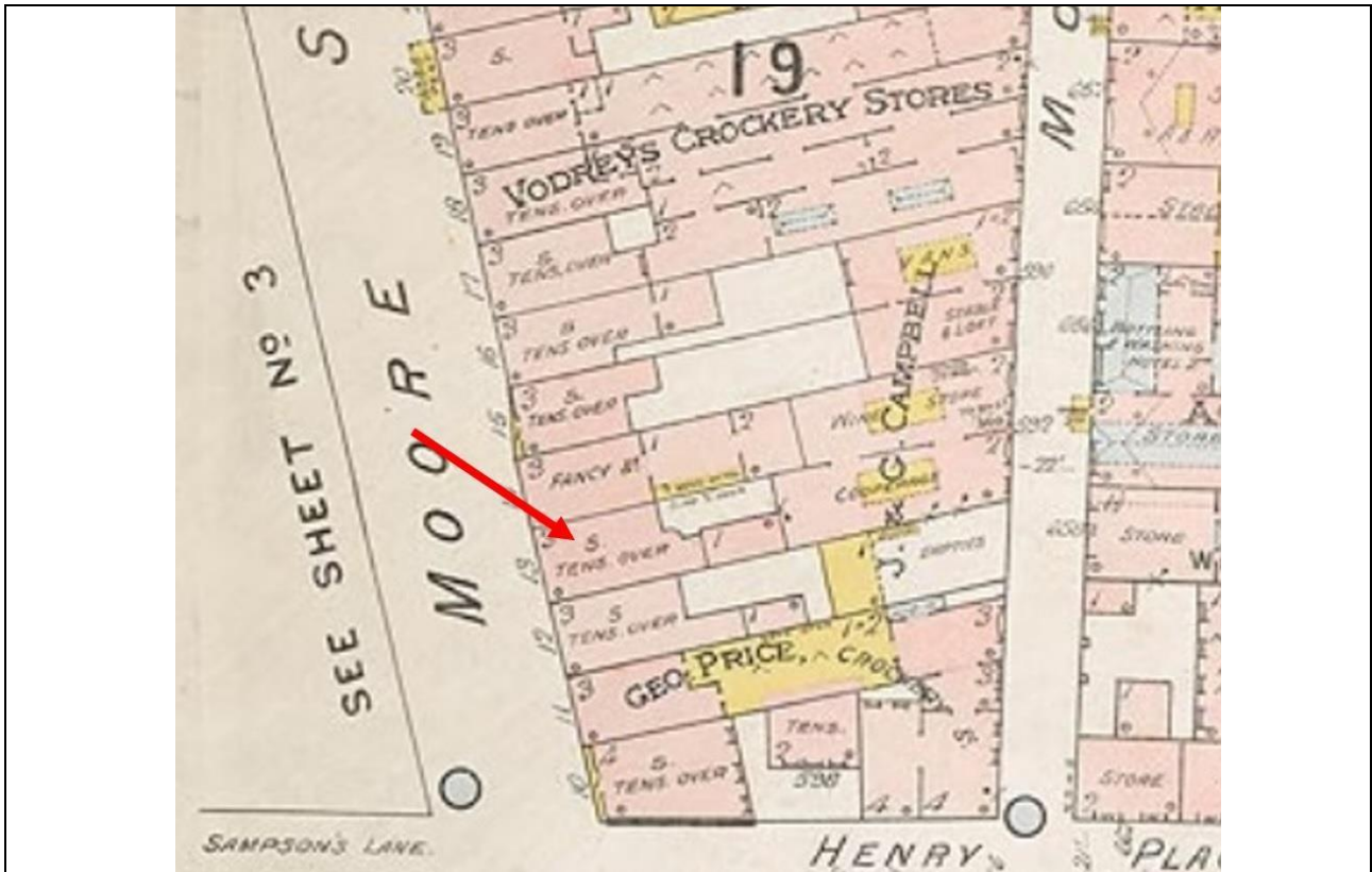
Fig. 9: 1893 Goads Insurance Plan of the City of Dublin, with 13 Moore Street arrowed in red.