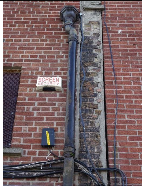
Fig. 6: Detail of the retained historic brick party wall between 12 and 13 Moore Street