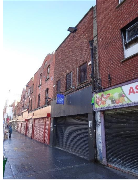
Fig. 4: 13 Moore Street in context with 14-17 Moore Street (National Monument) to LHS