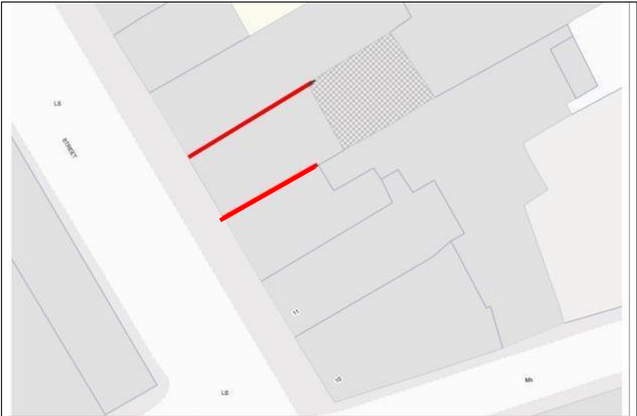
Figure 2: Section of surviving historic brick party wall between Nos. 13 and 12 Moore Street, and Nos 13 and 14 Moore Street, Dublin 1: extent of Protected Structure status and curtilage outlined in red. It is noted that No. 14 Moore Street is already on the Record of Protected Structures and forms part of the National Monument at 14-17 Moore Street, Dublin 1.

The extent of protected structure status & curtilage is shown on the map below in red.