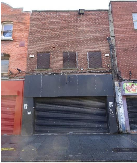
Fig. 3: The principal (west) elevation of No.13 Moore Street