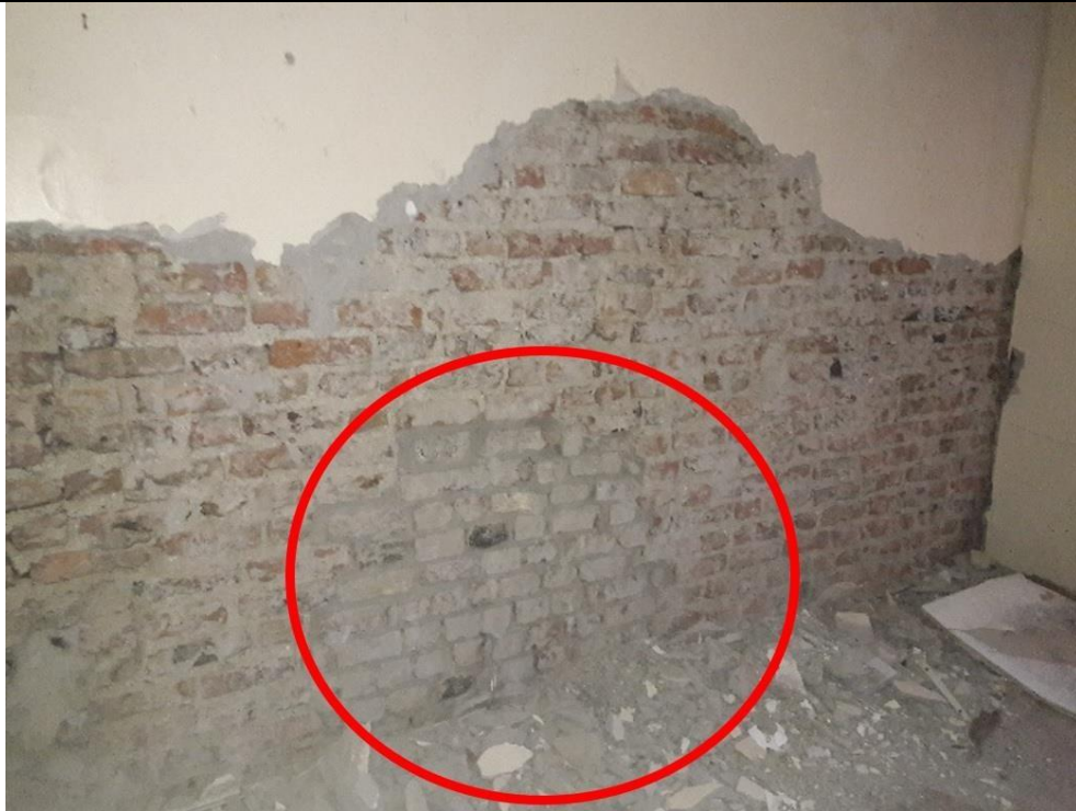
Fig. 7: Historic brick party wall at first floor level in 13 Moore Street. The infilled 'creep hole' is shown encircled in red.