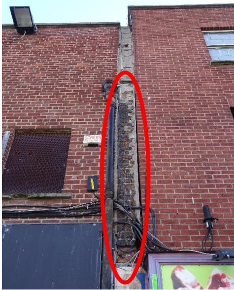
Fig. 5: Retained two-storey section of historic party wall (encircled red) between the modern new-builds at 12 (RHS) and 13 (LHS)