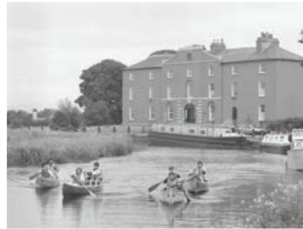
Canoeing, County Kildare

Students who have completed the Lord Mayor's Certificate in Local Studies will be eligible to join the Local Alumni Group, which has been in operation at Dublin City Library & Archive for some years. Membership of this group is free of charge. Members give papers based on their research in a supportive setting; outings are arranged from time to time.