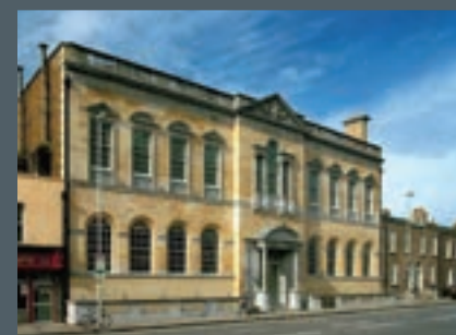
Dublin City Library and Archive on Pearse Street, Dublin 2

Dublin City Library and Archive, 139 – 144 Pearse Street, Dublin 2, D02 HE37