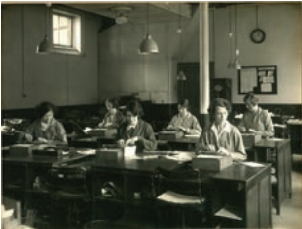
Dublin City Photographic Collection – DCLA

Participants are required to have an interest in oral history together with an indication of capacity and availability to commit to the course.