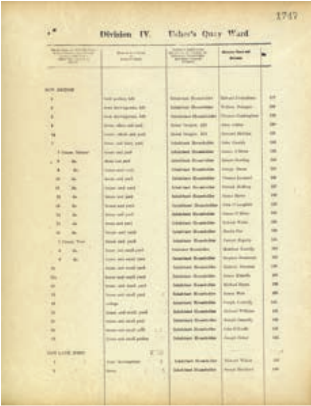
Electoral register 1915