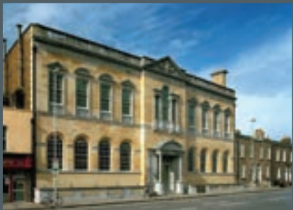
Dublin City Library and Archive on Pearse Street, Dublin 2

Dublin City Library and Archive, 139 – 144 Pearse Street, Dublin 2, D02 HE37