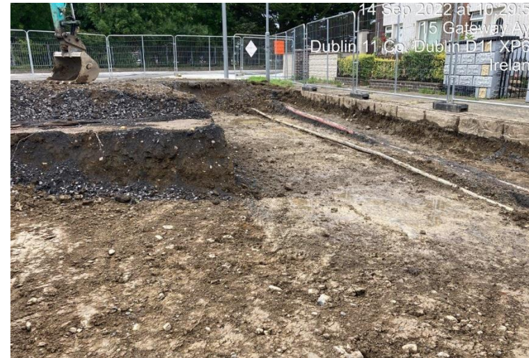
Figure 2 Road Construction Works