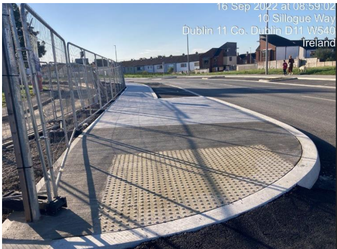
Figure 3 Footpath Construction Works