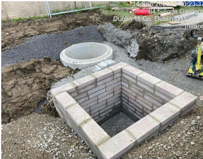
Figure 1 Manhole Construction - Deep Excavations