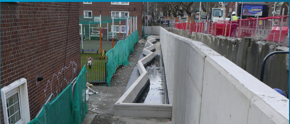
New retaining wall constructed at James Larkin House with areas for future planting