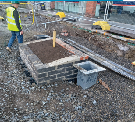
Bespoke designed tree pits are being installed to support new trees on the scheme