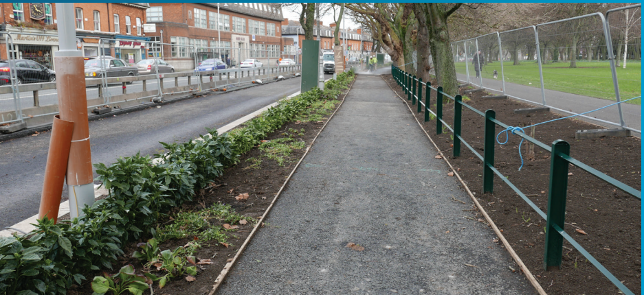
Works are greatly progressed on the inbound side through Fairview and the Park