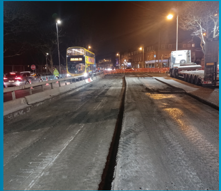
Road re-construction at each of the major junctions along the route continues