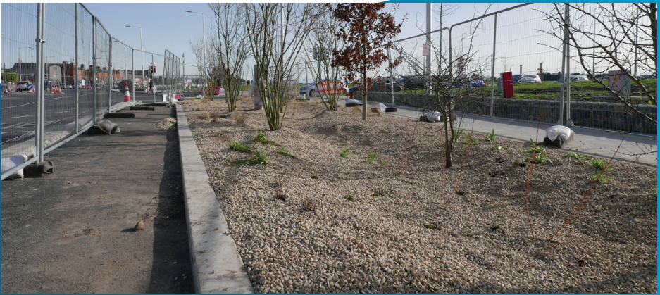
Paving and landscaping along the route continues