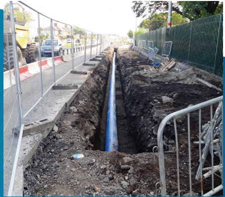
Approximately 6km of 100 year old watermains are being replaced throughout the route