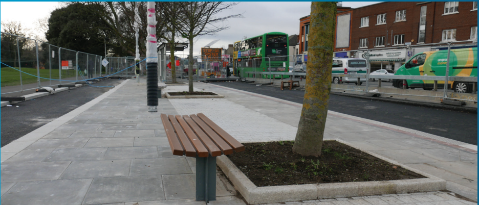
New planting, benches and paving installed to form a plaza at the Fairview footbridge