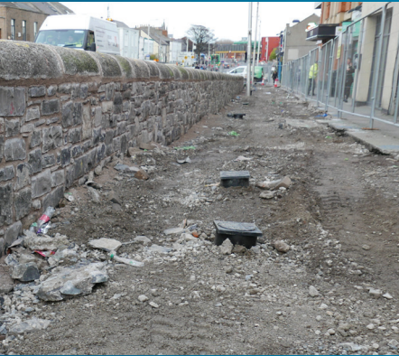
Reconstruction of historic stone wall on North Strand Road