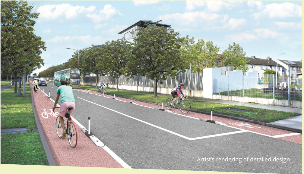
Artist's rendering of detailed design

It is anticipated that the installation works on this scheme will commence early 2023. In order to deliver this scheme, there will be some minor temporary disruption to traffic to the area. Dublin City Council, in collaboration with our contractor will endeavour to minimise this as much as possible.