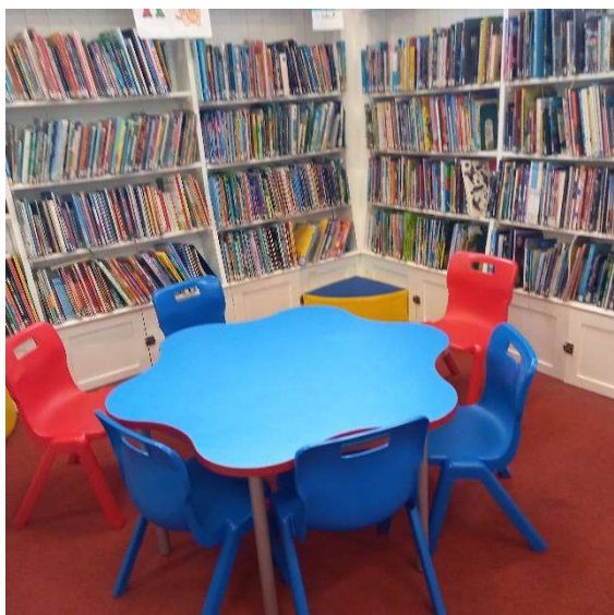
This is the Junior Library.