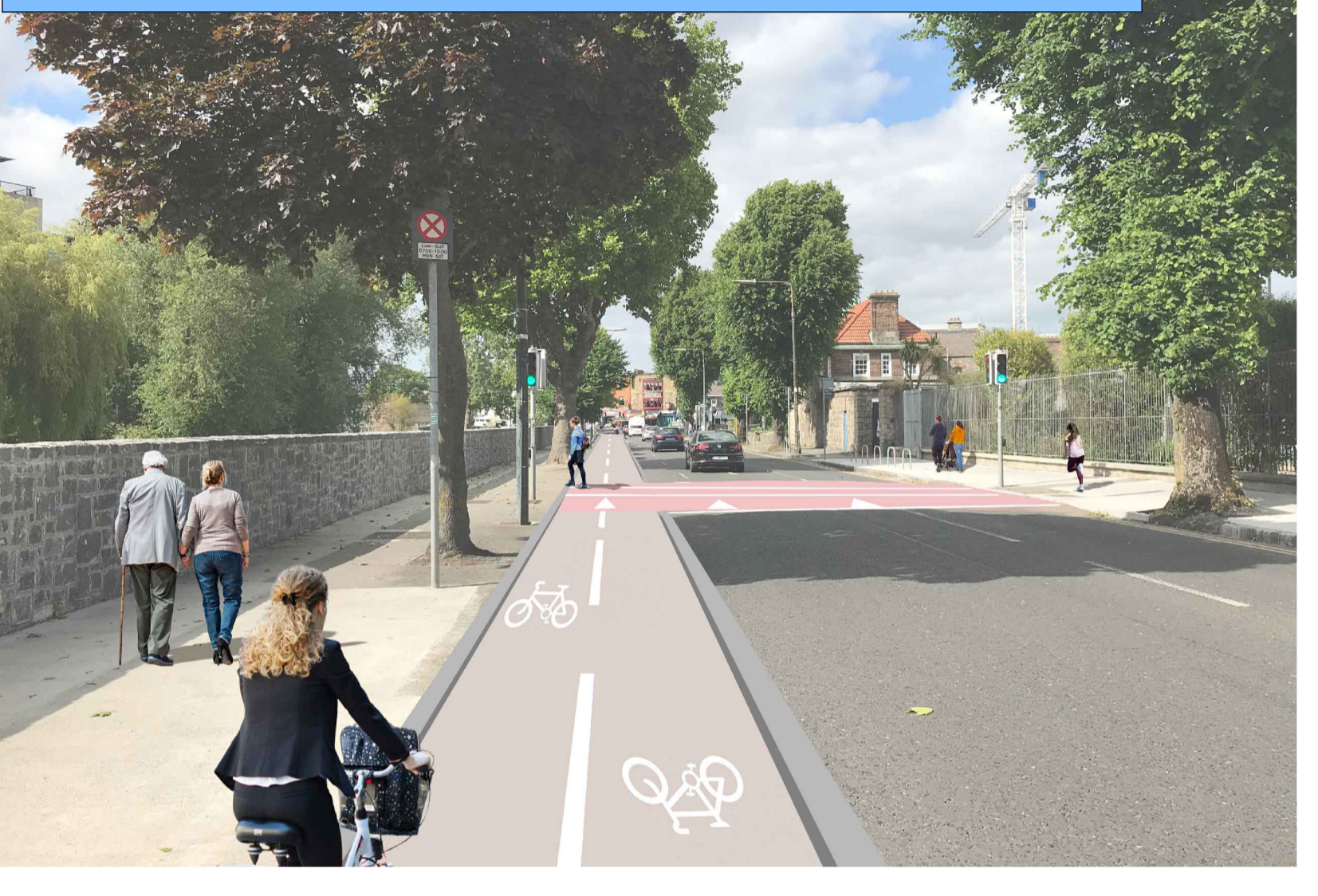
ARTISTS IMPRESSION OF THE PROPOSED LAYOUT ON ANGLESEA ROAD