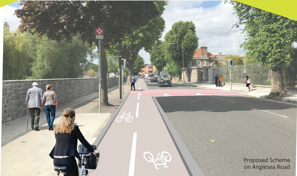
Proposed Scheme on Anglesea Road