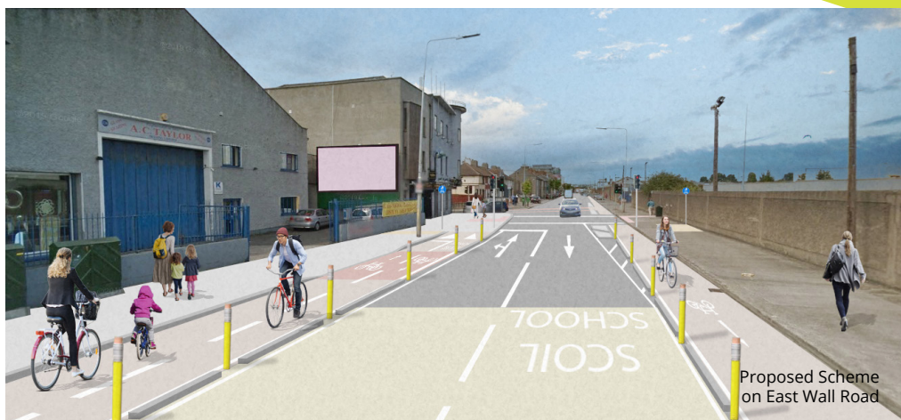
Proposed Scheme on East Wall Road