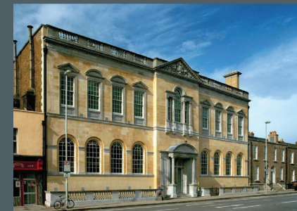
Dublin City Library and Archive on Pearse Street, Dublin 2

Dublin City Library and Archive, 139 – 144 Pearse Street, Dublin 2, D02 HE37