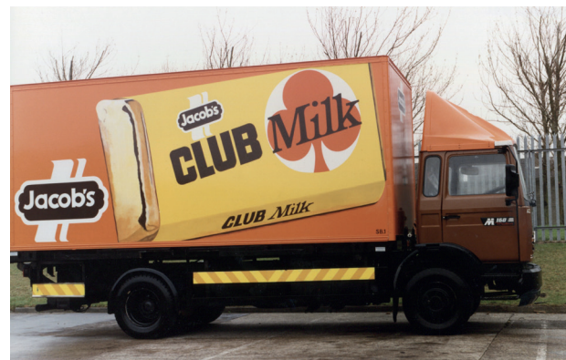
Jacob's delivery truck with Club Milk image on its side, Jacob's Biscuit Factory Archive, DCLA/JAC/06/008/28