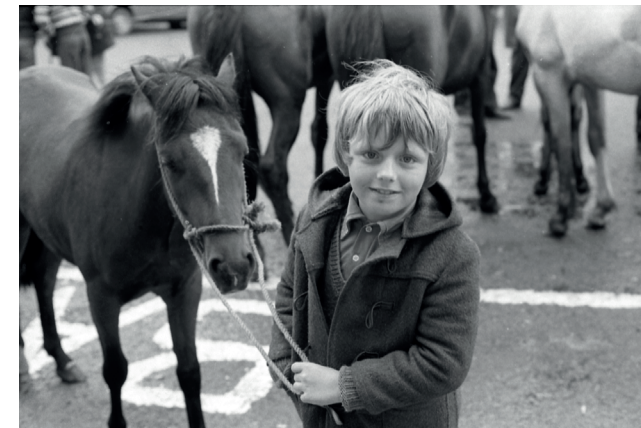
Horse Fair, Listowel, County Kerry