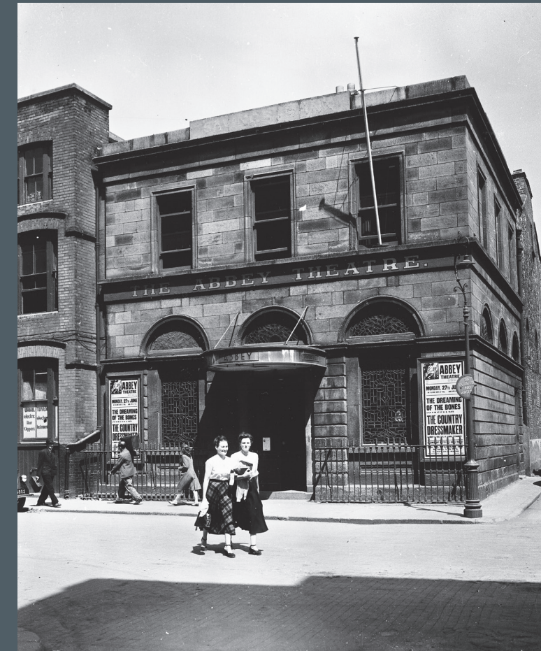
Abbey Theatre in 1949