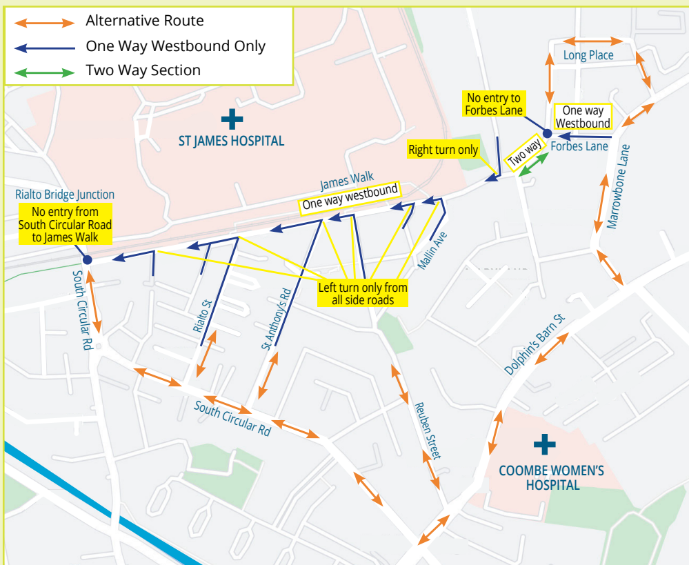
JAMES WALK AND FORBES LANE ALTERNATIVE ROUTES

Rialto Bridge Junction Left and right turns from South Circular Road on to James Walk will be prohibited. There are a number of road crossings to be carried out at this junction outside of peak traffic hours. The works at this location will be completed towards the end of the Section 1 implementation.