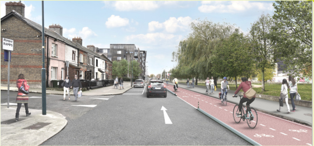
Two way protected cycle track on the North side of James Walk