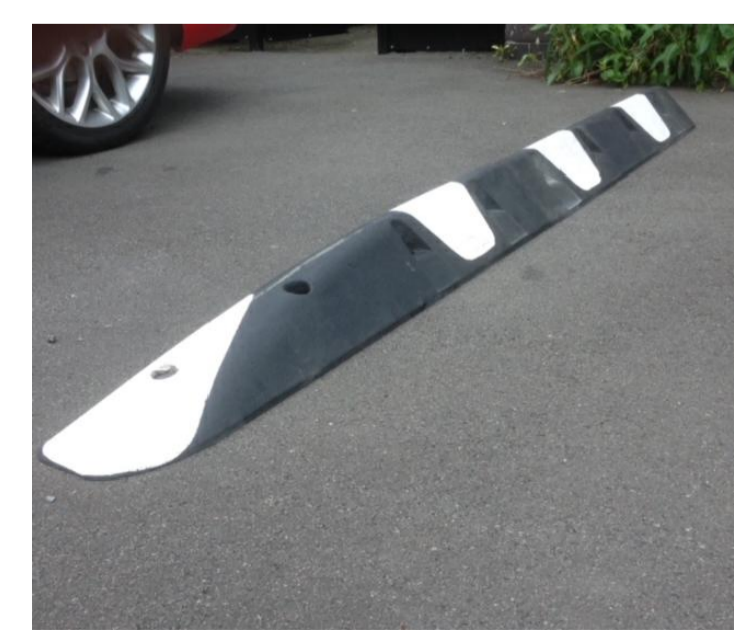
PROPOSED BOLT DOWN ORCA KERB