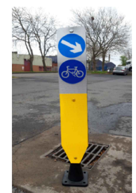
PROPOSED REGULATORY BOLLARD