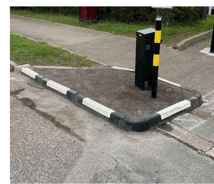
PROPOSED BOLT DOWN RUBBER KERB