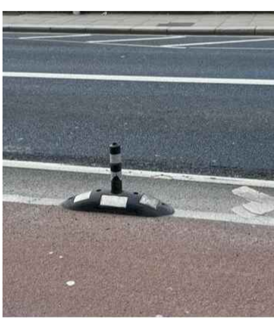
PROPOSED MINI SHERGAN