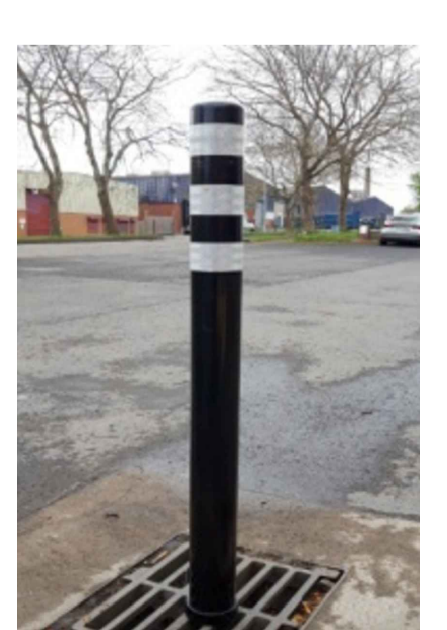
PROPOSED FLEXI BOLLARD