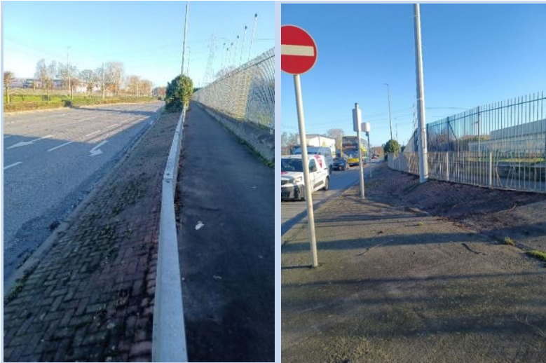
Somerville Ave/Balfe Ave Lane – weeding and removal of overgrowth