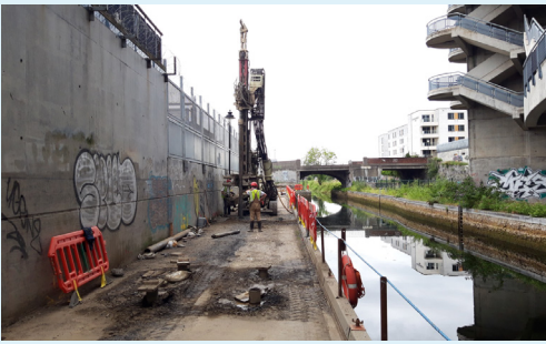
Installing foundations for the ramp structure near Croke Park