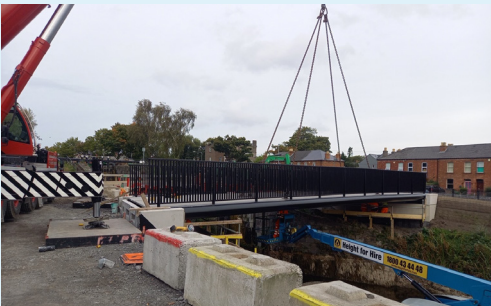
New bridge being installed at Lock 3