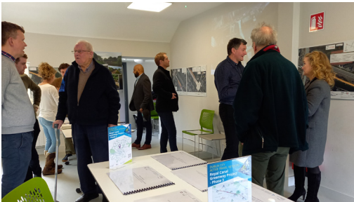
Mud Island Cottage, 4th of April 2023

Members of the community were invited to drop in to view information displays, provide feedback and meet the project team at Mud Island Cottage, North Strand on Tuesday 4th April and at Phibsborough Library on Wednesday 12th April. Both events were well attended, with many people turning up each evening to view the drawings and to put questions to the project team.