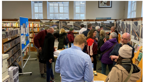
Phibsborough Library, 12th of April 2023