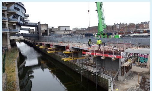
Ramp structure under construction near Croke Park