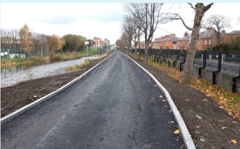
Greenway kerbs laid between Lock 3 and Lock 4