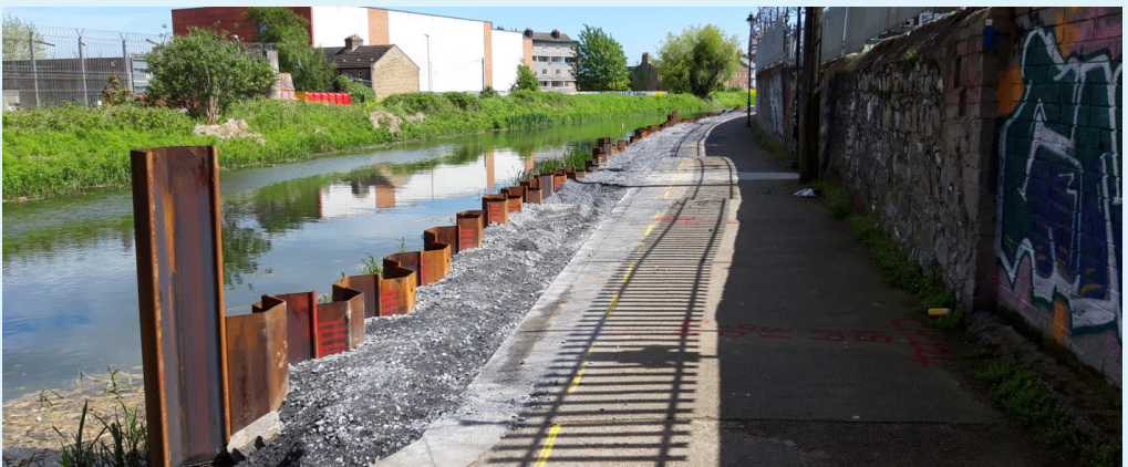
Strengthening of the canal bank between Croke Park and Clarke's Bridge