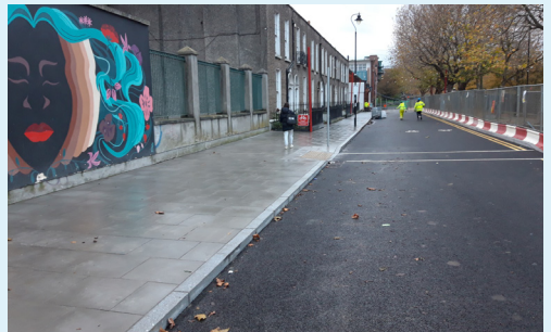
New footpath and road surfaces on Charleville Mall