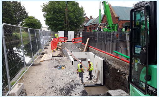
Installing a high voltage electricity cable joint bay near Charleville Mall