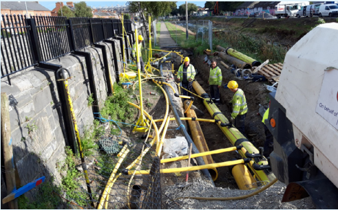
Diverting a gas main near Lock 3