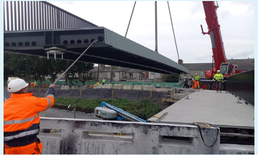
New bridge being installed at Lock 3