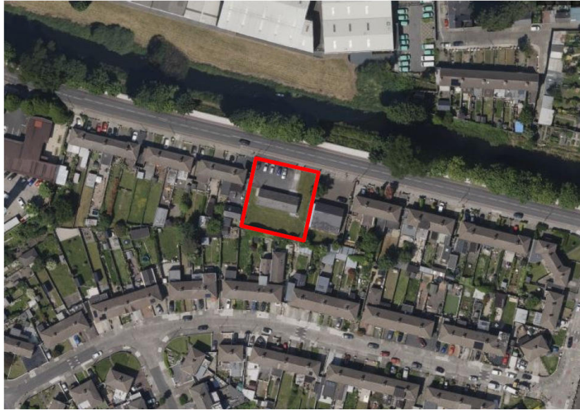
Figure 1: Location of Subject Land