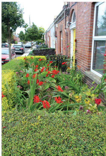
Broadstone Basin Residents Association (BBRA)