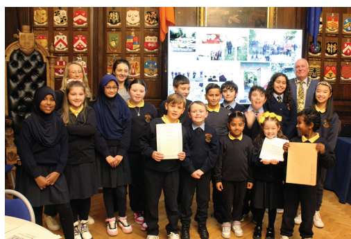
Scoil Treasa Naofa - Winners of Schools Category