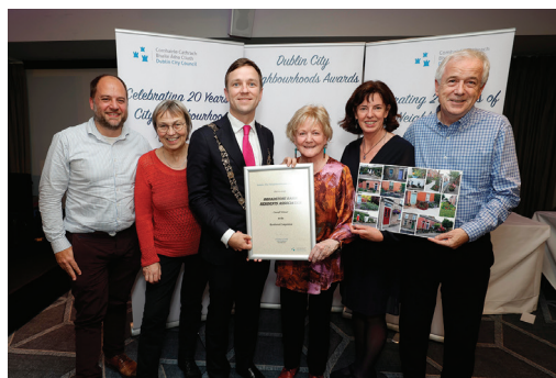
Broadstone Basin Residents Association (BBRA) - Winners of Residential Category