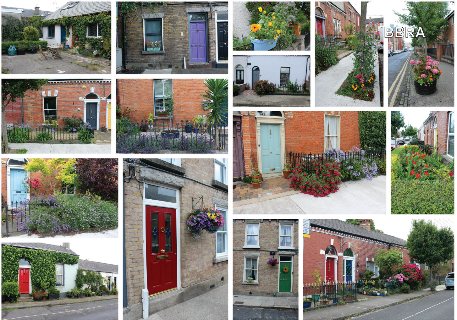
Broadstone Basin Residents Association (BBRA)