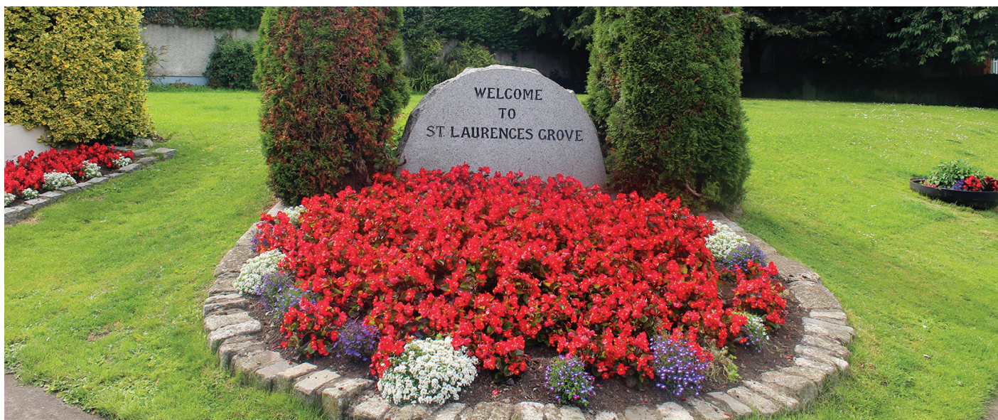
St. Laurences Grove

T. 01 222 4243 / 222 4827 / 222 4398 E. LMO@dublincity.ie W. www.dublincity.ie