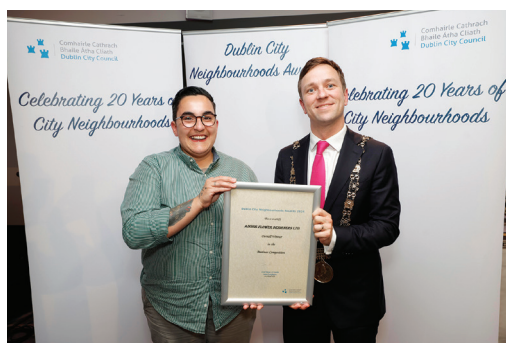
Adonis Flower Designers - Winner of the Business Category