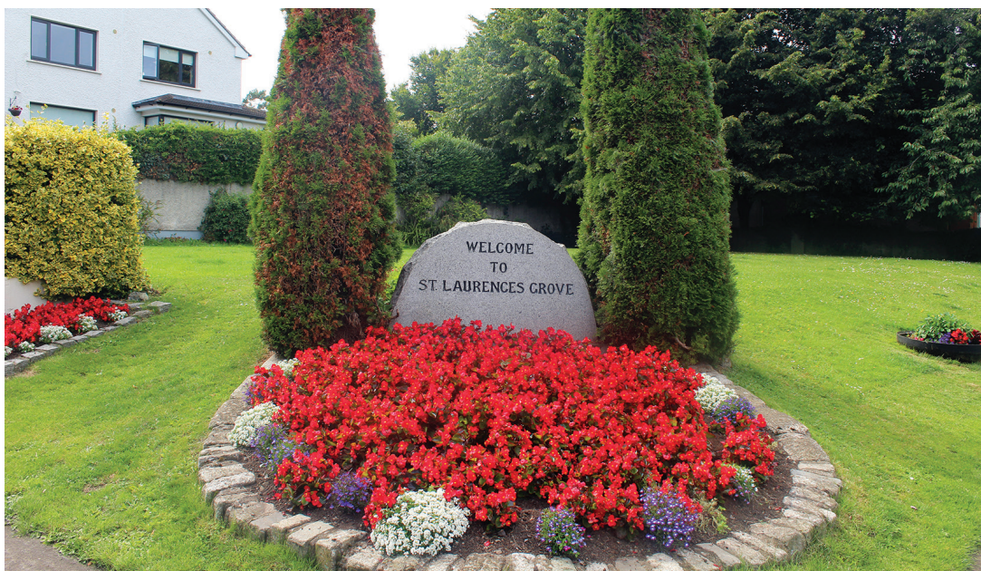
St. Laurences Grove