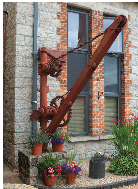
The Pump House