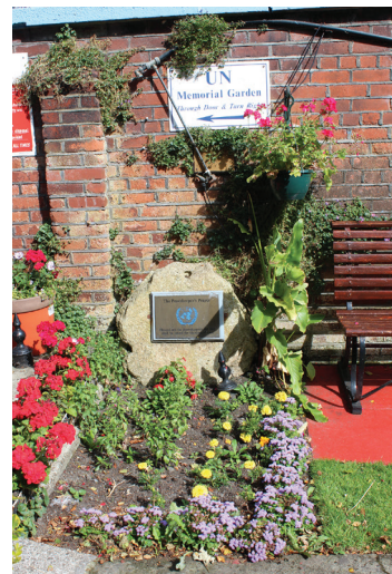
Irish United Nations Veterans Assoc. (IUNVA)