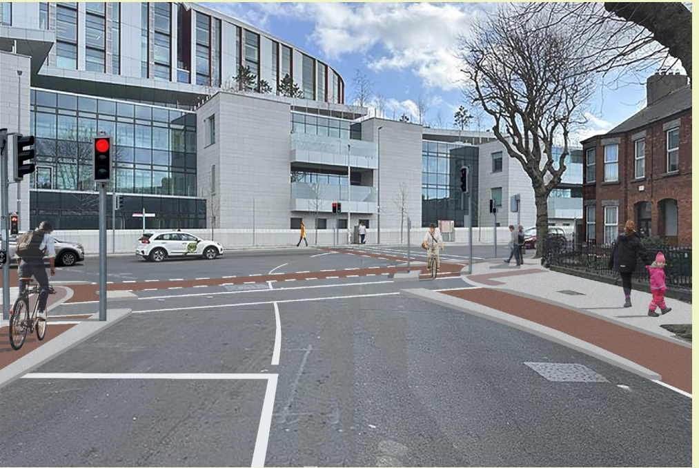
An artist's impression looking East on South Circular Road