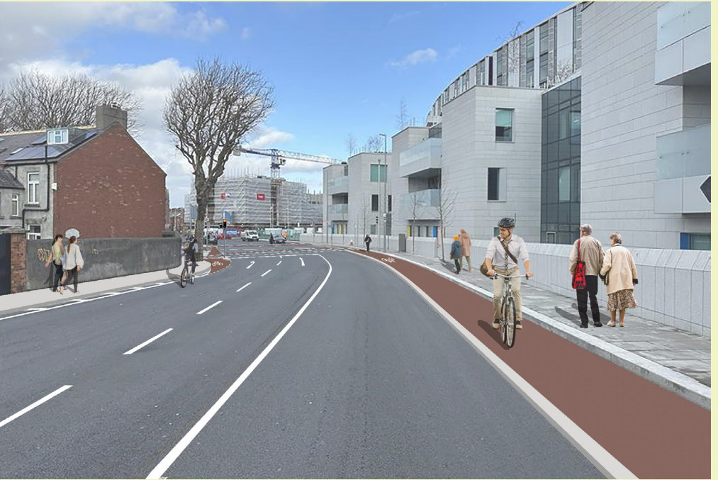
An artist's impression looking North on South Circular Road