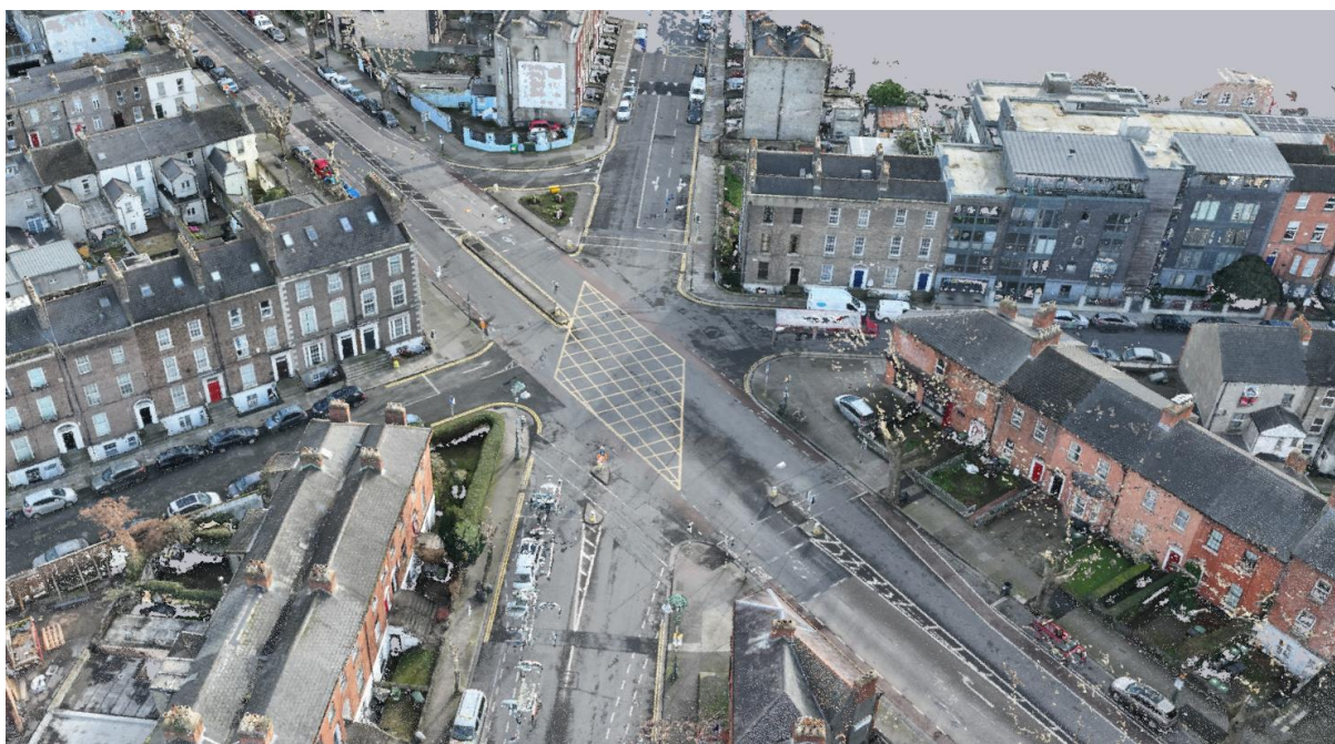
Figure 3: Existing view of North Circular Road junction with Belvedere Road, Belvedere Place, Sherrard Street Lower and Sherrard Street Upper.