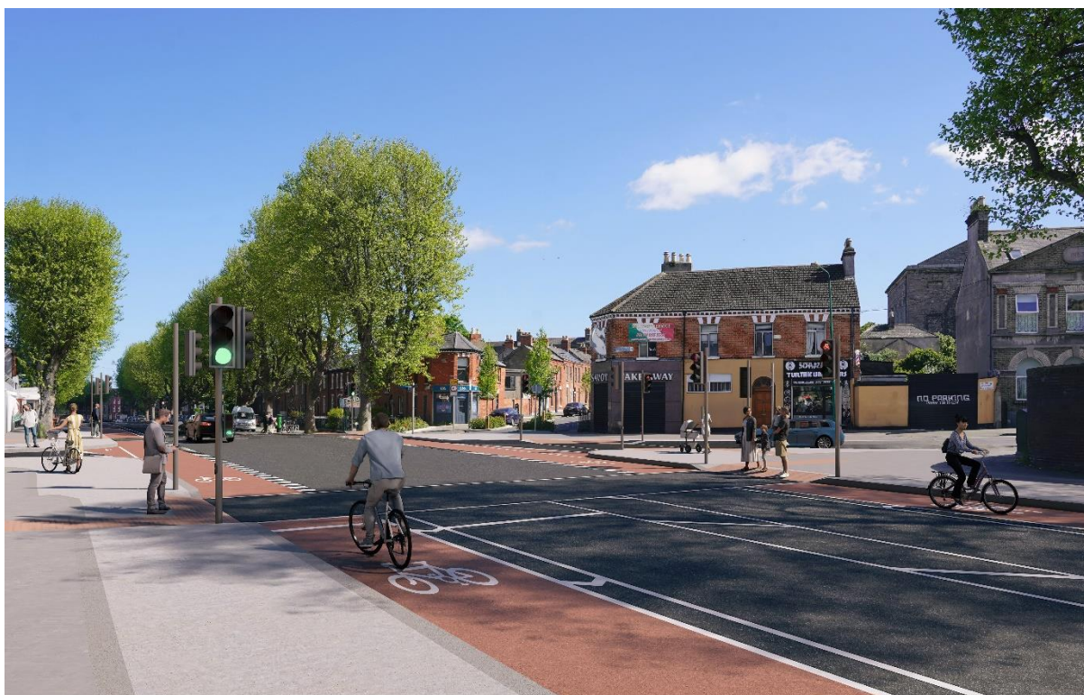
Figure 6: Artist's impression of proposed changes to North Circular Road, looking east towards junction with Fitzgibbon Street and Russell Street.