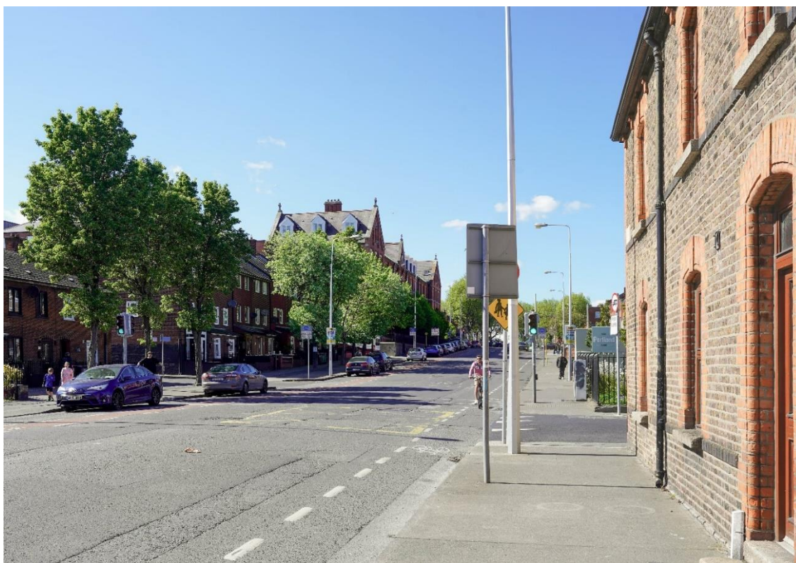
Figure 9: Existing view of Portland Row, looking west towards junction with North Circular Road, Summerhill & Summerhill Parade.