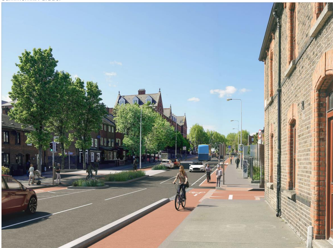
Figure 10: Artist's impression of changes to Portland Row, looking west towards junction with North Circular Road, Summerhill & Summerhill Parade (Image shows potential greening – exact planting type and area to be agreed at detailed design stage). Note: Signage in foreground only removed from visualisation for clarity – they are to be retained under the scheme.