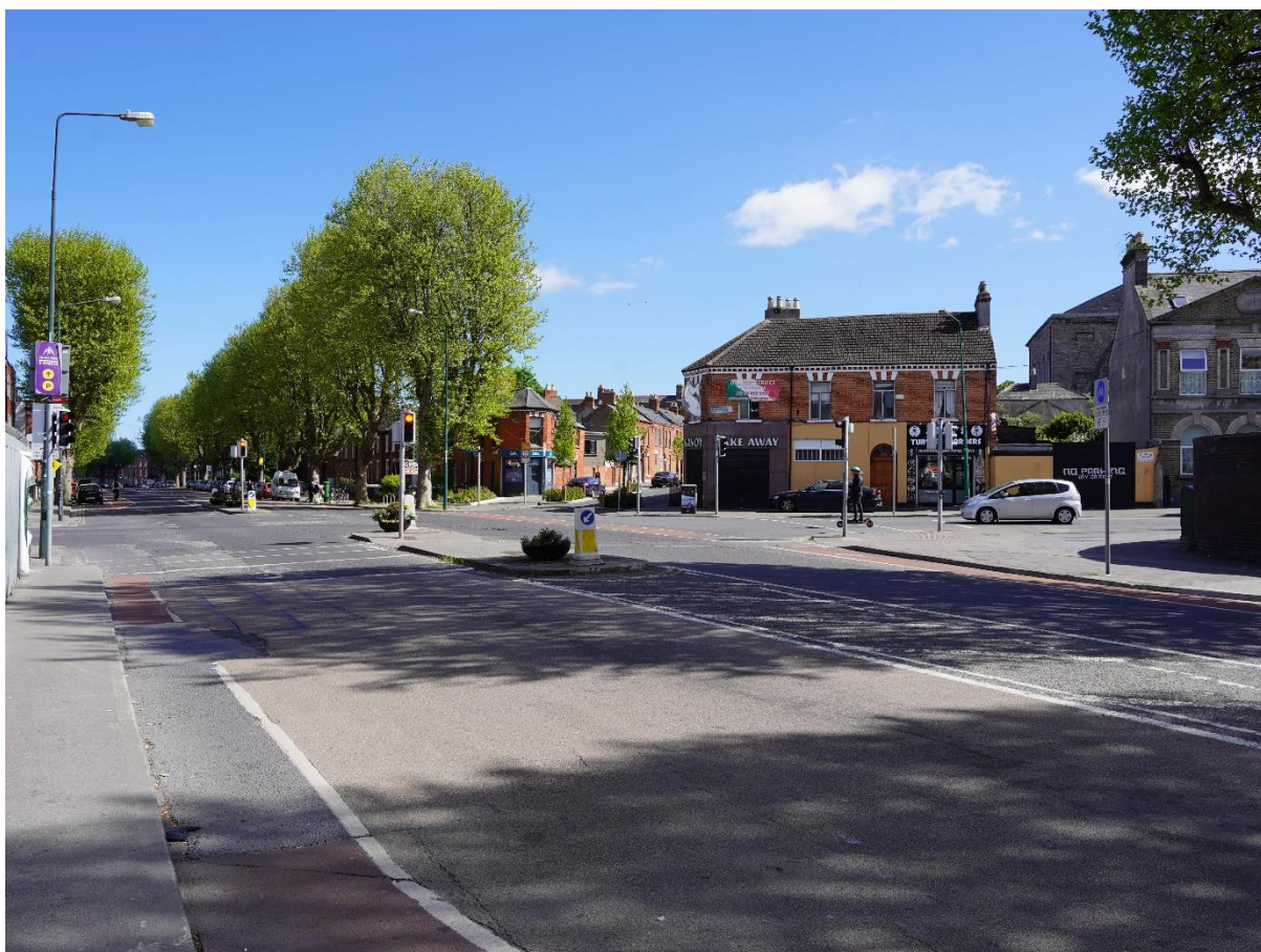
Figure 5: Existing view of North Circular Road, looking east towards junction with Fitzgibbon Street and Russell Street.