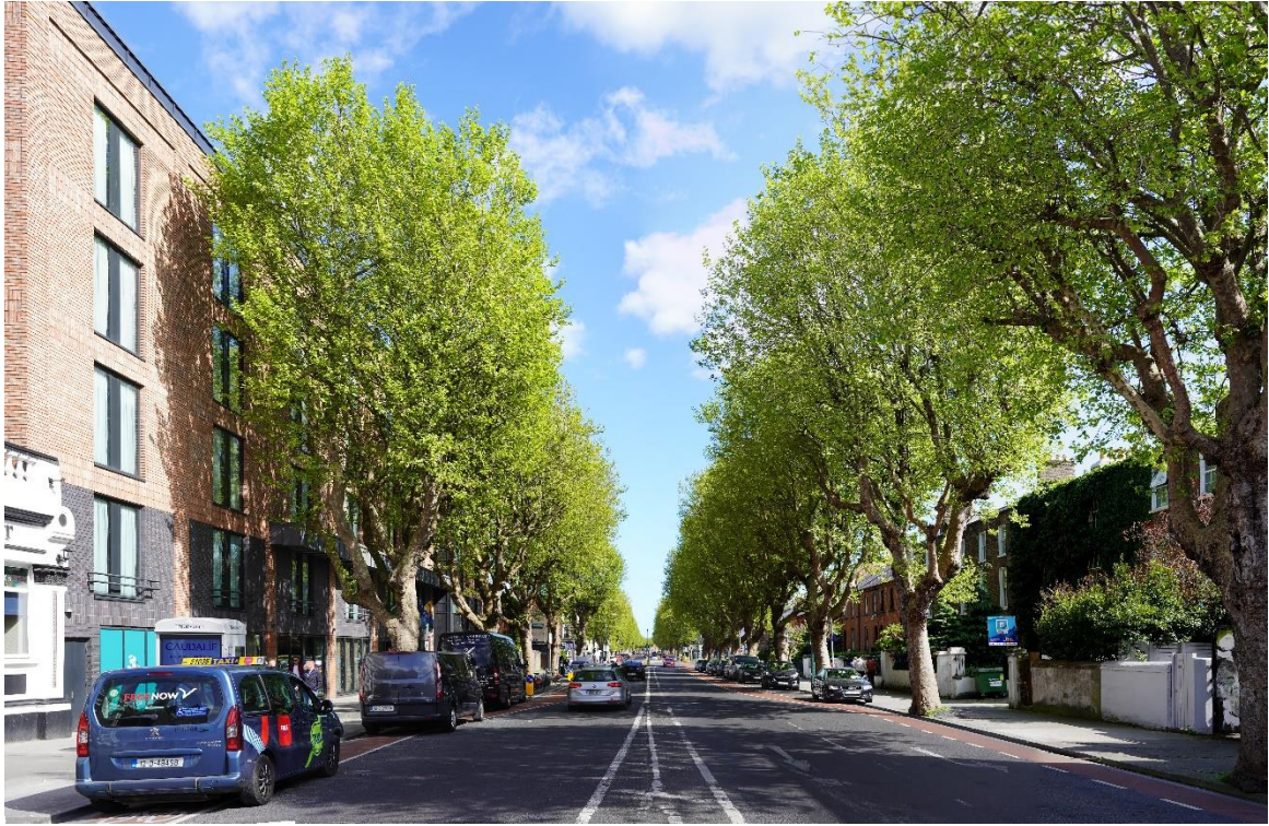
Figure 1: Existing view of North Circular Road, looking east from Dorset Street Lower junction.