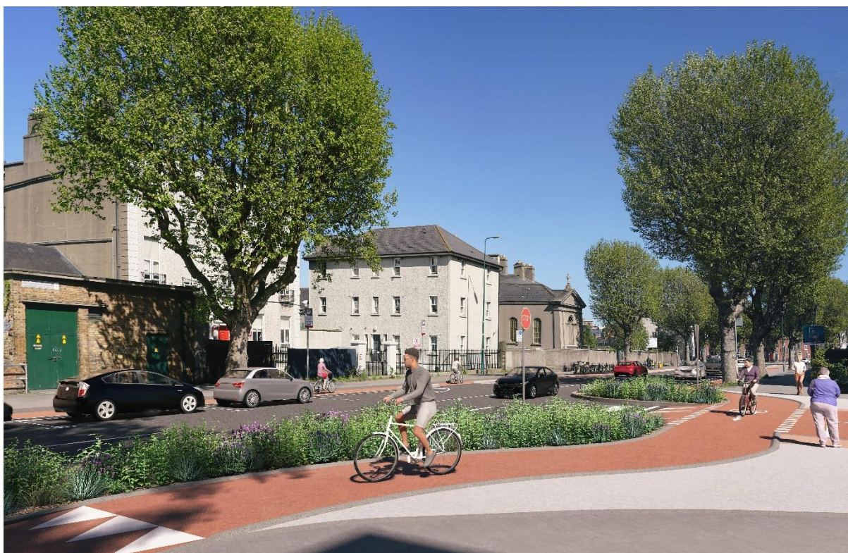
Figure 8: Artist's impression of proposed changes to junction of North Circular Road and Charles Street Great – (Image shows potential greening – exact planting type and area to be agreed at detailed design stage).