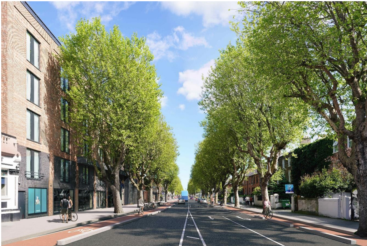
Figure 2: Artist's impression of North Circular Road – Looking east from Dorset Street Lower junction.