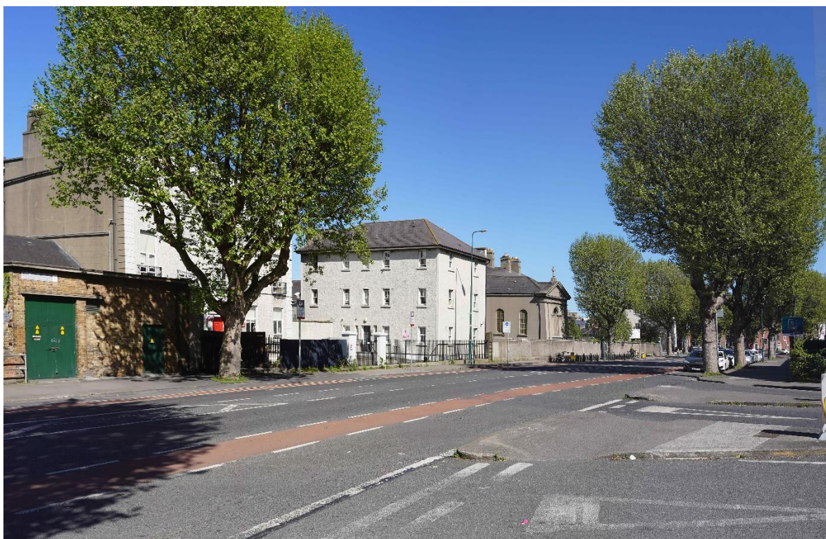
Figure 7: Existing view of North Circular Road junction with Charles Street Great