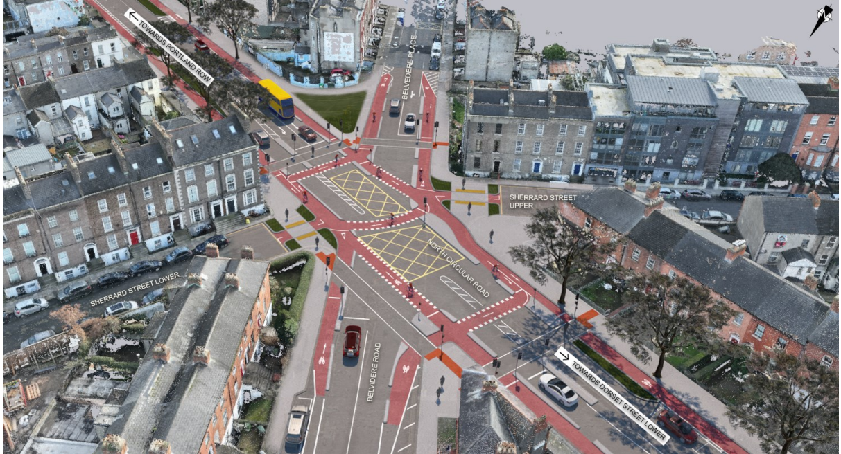
Artist's impression of North Circular Road/Belvedere Road/Sherrard Street Upper and Lower Junction

The project is being led by the Water Framework Directive Office in collaboration with Fingal County Council and DCC Active Travel Programme Office. The Active Travel Programme Office is only providing support for the integration of active travel infrastructure.