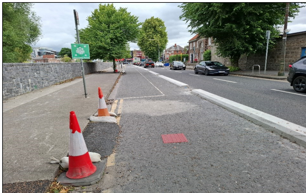
New cyclist protection kerb installed at Beatty's Avenue.

This project began construction on 13th January 2025. The works to provide underground cabling and junction boxes to the two proposed signal-controlled pedestrians and cyclists crossings on Merrion Rd and Anglesea Rd are now complete. New kerb and footpaths alongside and around these crossings area also complete. Remaining works include permeable paving around the tree pits, Macadam and Surfacing works including ramps, commissioning of lights, tie in works at Herbert Park Lane Bridge. The works are expected to be completed in Q3 2025.