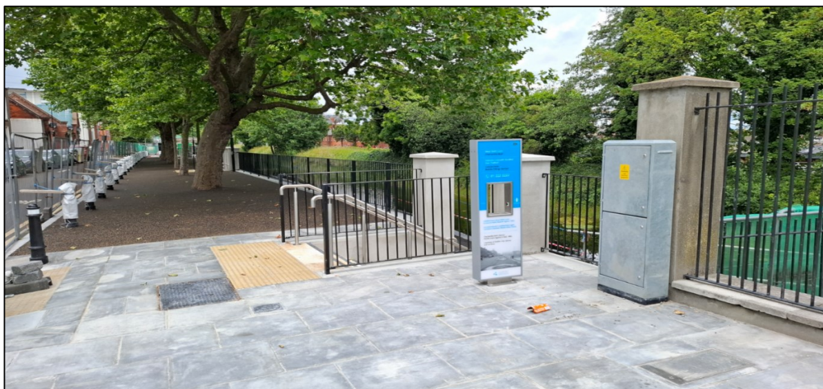
New Flexipave, footpath, steps, railings and water bottle filling station on Charleville Mall

Parapet railing installation works commenced on the Clarke's Bridge ramp in June and were completed in advance of the opening of Section 4 to the public on 20 th June.