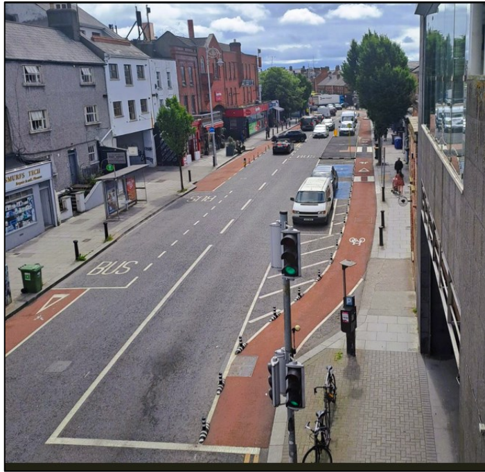
New Cycleways on Ranelagh Road