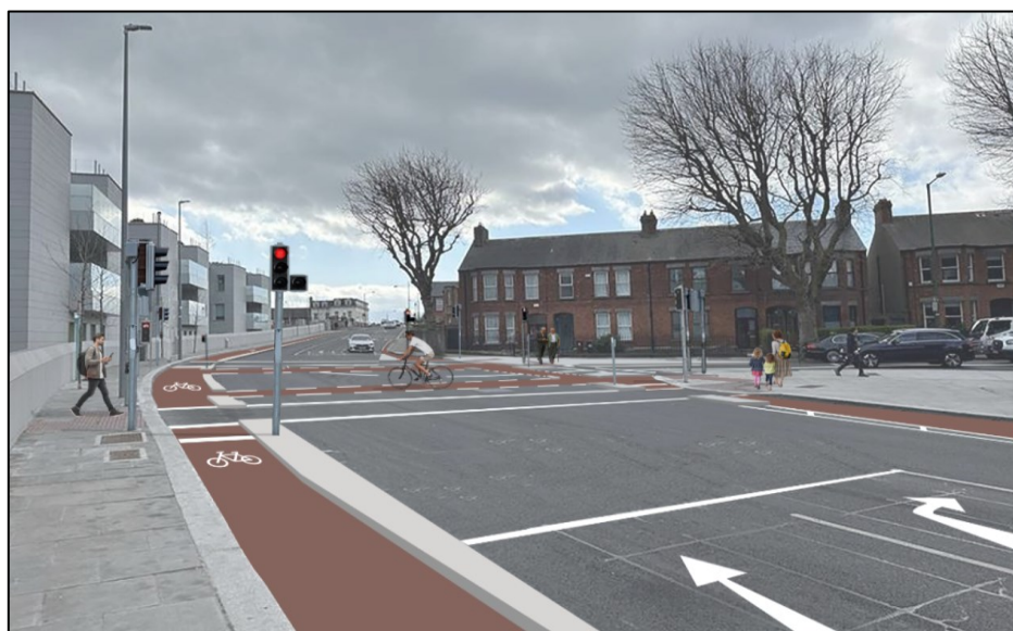
Photomontage images of completed junction upgrade