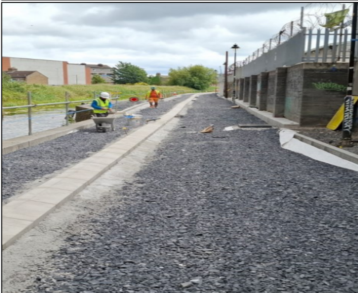
Stainless steel parapet railings on Binns Bridge ramp Kerbing between Croke Park & Clarke's Bridge