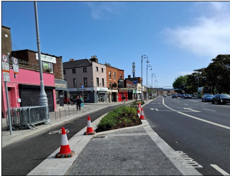
Clontarf to City Centre Scheme – Fairview Ave Lower – Additional Measures (work-in-progress)

Works relating to additional measures at Fairview Avenue Lower and at Merville Avenue have progressed well in June with some further markings and red surfacing still to be undertaken.