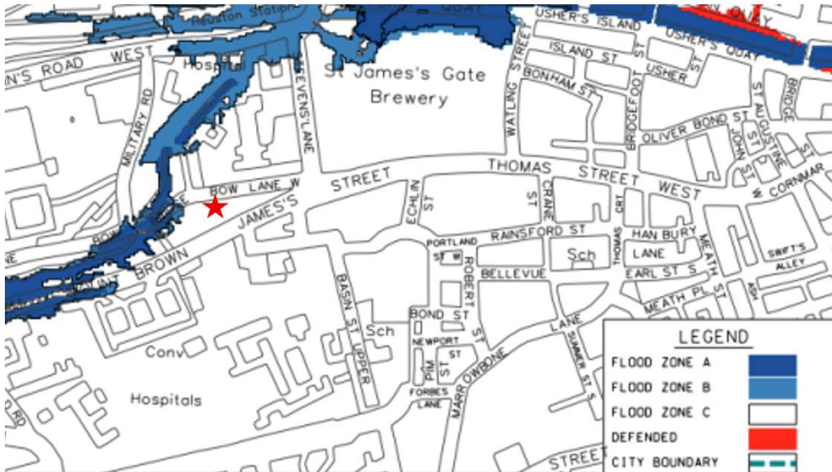
Figure 2: Composite Flood Map, Appendix E of the Dublin City Development Plan 2022 – 2028 Strategic Flood Risk Assessment, Dec 22. This shows the lands at 16 - 23 Bow Lane West marked with a red star and located in Flood Zone C.

The lands are therefore located within Flood Zone C with regard to fluvial and canal flood risk. The lands are also located outside of the estimated 100 year flood extent with regard to pluvial flood risk. Finally there is no tidal flood risk to 16 - 23 Bow Lane West.