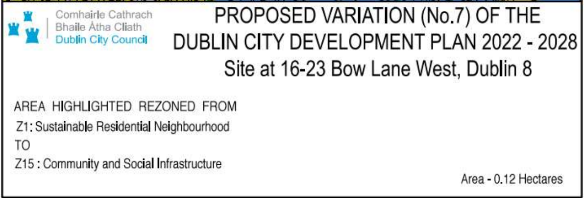
Figure 1: Location of Proposed Variation (No. 7) to the Dublin City Development Plan 2022-2028.