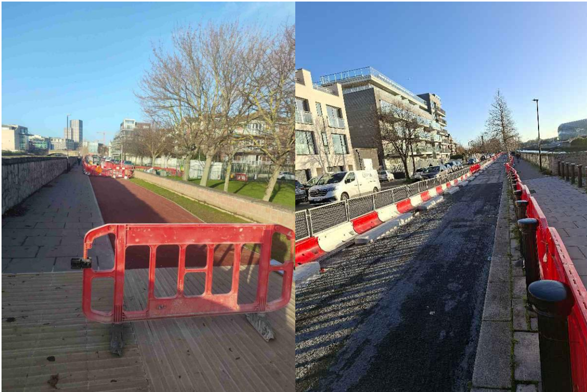
New porous red cycle track. Planed out Road and new traffic islands, Fitzwilliam Quay