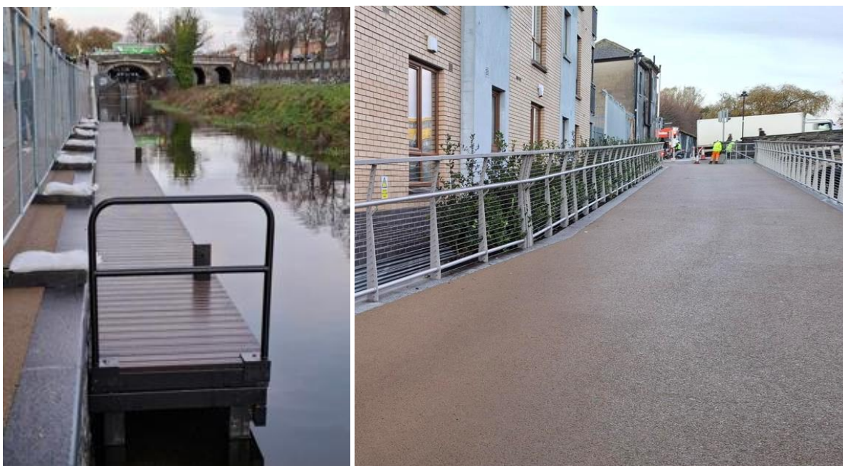
Lowered jetty and Binns Bridge ramp planter with native holly bushes

Portland Place Park has been vacated by the Works Contractor and the hoarding, with the exception of the access gates at the end of Portland Street North, are being removed. DCC Parks, Biodiversity and Landscape Services Division are currently progressing a design for the refurbishment of the park.