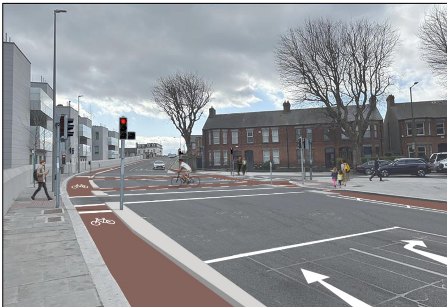
Photomontage image of completed junction upgrade

The project is anticipated to go to construction in advance of the opening of the hospital in 2026.