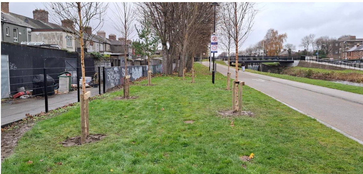
Tree planting at former construction compound

Seven new trees were planted on the site of the construction compound adjacent to the former Spain's warehouse, to the rear of Saint Ignatius Road, in early December 2025. Outstanding shared space signage on Binns Bridge was also installed at this time.