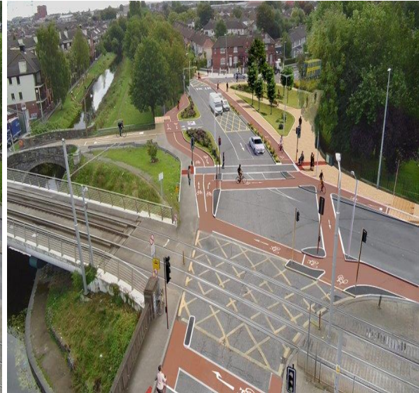
Suir Road Junction proposed layout