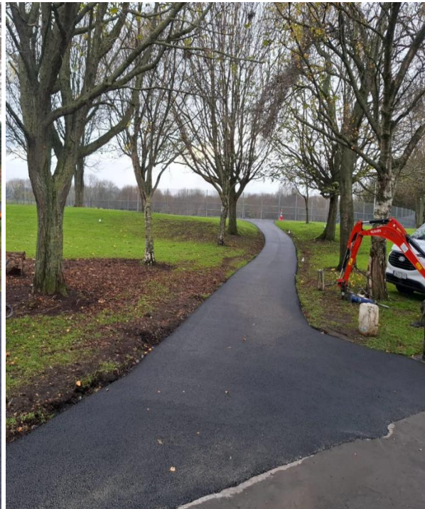
Eamonn Ceannt Park

It is expected to continue the rollout of these upgrades next year, with Liffey Valley Park and California Hills Park identified as locations for improvement works.