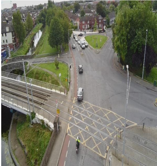
Suir Road Junction current layout