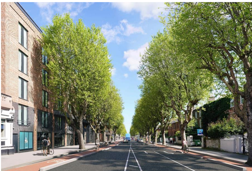
Artist's impression of North Circular Road – Looking east from Dorset Street Lower junction.

The scheme will provide 1.1km of improved walking and cycling facilities as well as the upgrading of the junctions at Belvedere Rd, Fitzgibbon Street, Summerhill and other local side roads. There will be additional greening at side roads and new 'pocket parks' at the Belvedere Place junction. Six no. bus stops are being provided as part of NTA's proposed Orbital bus route.